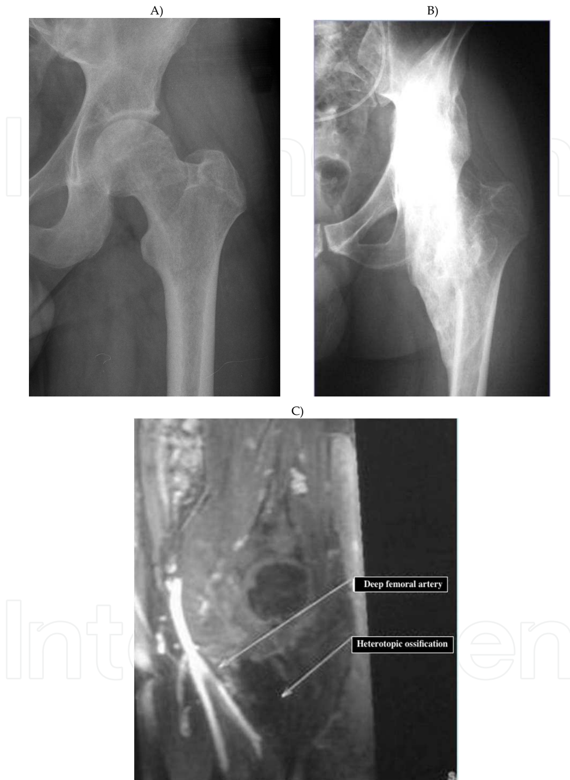
Figure 1. Neurogenic ossification in the hip in a patient after a traumatic brain injury. A) Radiograph of the left hip six months after the brain injury. B) Radiograph showing an anteromedial ossification around the hip causing severe ankylosis, 14 months after the initial injury. C) MRI enhanced with contrast showing a close relationship between the ossification and the deep femoral artery.