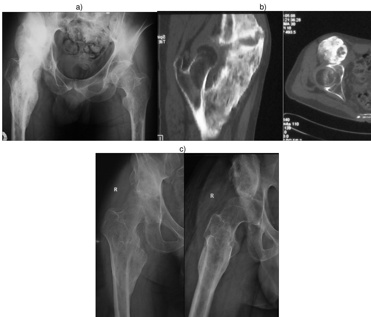
Figure 3. Heterotopic ossification in the right hip causing severe ankylosis. a) Preoperative imaging showing a huge HO from the lesser trochanter to the ilium. b) Preoperative CT-Scan showing involvement of the muscles iliopsoas, vastus medialis and vastus intermedius. b) Radiograph 12 months after surgery.

data have shown the benefit of radiotherapy or medical treatment when ossifications are mature, it is reasonable to use prophylactic treatment postoperatively aiming to prevent recurrence. [66].