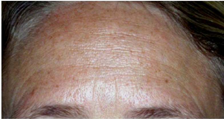
Figure 5. Lower face before needling with 3 mm Roll-CIT