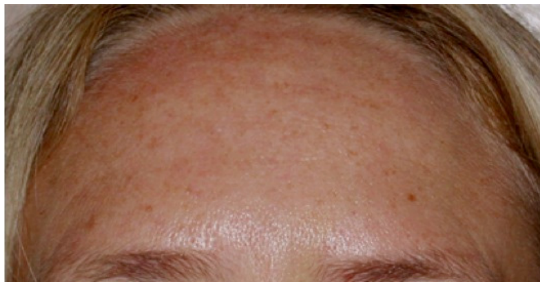
Figure 6. After Roll-CIT and skin care.