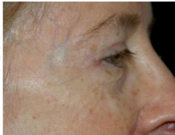
Figure 4. One year later with no surgery peeling or anything else except daily skin care enhanced by using the Cosmetic Skin Roller