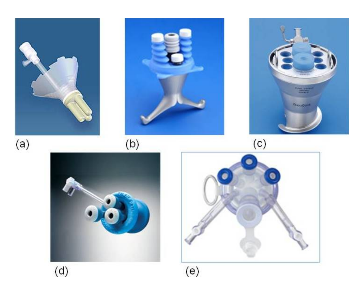
Figure 1. Single port systems: (a) Uni-x (Pnavel Systems, Morganville, New Jersey, USA); (b) X-Cone (Karl Storz, Tuttlingen, Germany); (c) Endo-Cone (Karl Storz, Tuttlingen, Germany); (d) SILS Port (Covidien, Norwalk, Connecticut, USA); (e) Olympus TriPort + (Advanced Surgical Concepts, Bray, Ireland.

articulating or curved instruments and flexible scopes, have been introduced to recreate