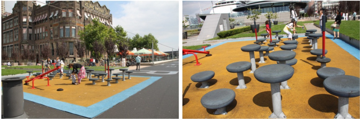
Figure 16. Play space from Rotterdam, Netherland