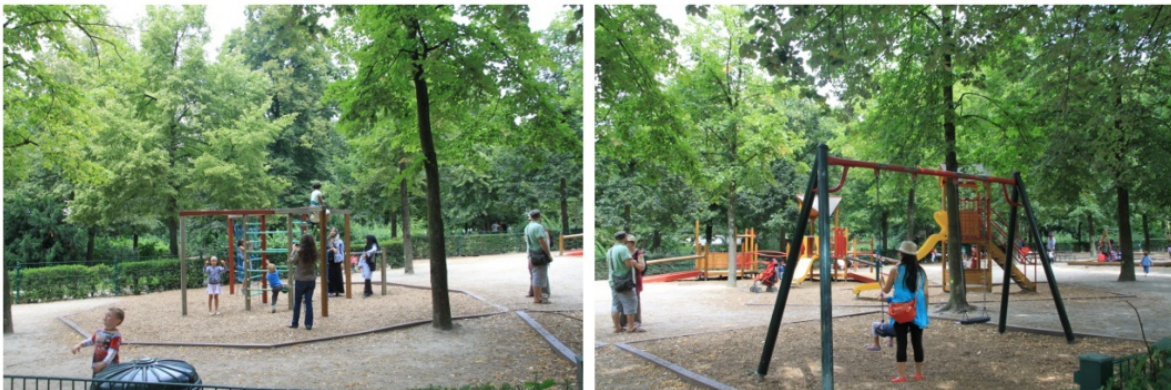
Figure 17. Figure 17. Play space from Brussels, Belgium

This area was designed in woodland in the city. It is particularly suitable for disabled people with ramp play equipment. It provides an opportunity to contact with nature for children as it is in a woodland area (figure 17).