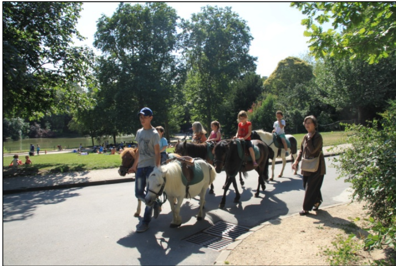
Figure 7. An activity allowing direct contact with nature- pony ride on the area-

"Study nature, love nature, stay close to nature. It will never fail you" Frank Lloyd Wright (Tai et al., 2006). This expression of Wright explicitly refers to the result of being in relationship with nature.