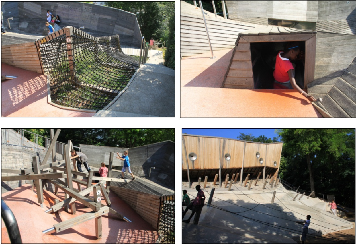
Figure 23. Play space from Paris, France