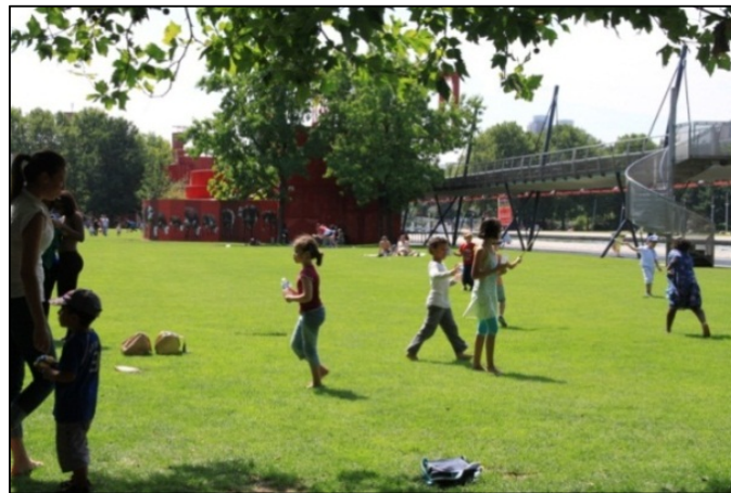
Figure 3. Open green spaces provide opportunities for different activities (Photo Acar, H., Paris, France).

Children use these opportunities according to their own imagination, creativity, or purposes (figure 4).