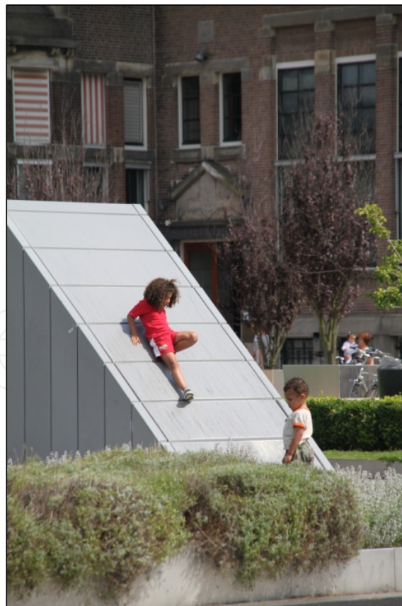
Figure 1. Sloping surfaces in any area are used to slide by children.