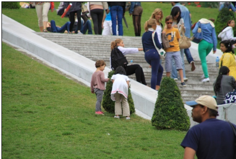
Figure 13. Plants are interesting materials for children

Children would like to see plants that can be used for play. For this purpose, plants can also be used to serve a variety of outdoor activities in open spaces designed for children. Trees, shrubs, flowers, vegetables and parts of these plants, such as branches, leaves, pinecones are important elements of children's environments and plays (figure 13, 14, 15). Plants in child environments are used with the objectives of enclosure, identity, movement, climbing, play props, programmed activities/education, accessibility/integration, landmarks, seasonal change, wildlife enhancement, climate modification, and environmental quality (Moore, 2002). Plants offer different color options in different seasons with their colorful leaves, flowers and fruits. Results of the author's master thesis that focused on the plant preferences for children play spaces revealed that children like red, yellow, mottled, blue and orange colored leaves while they do not like yellow and green colored leaves. Study also revealed that purple, pink and white flowers were favorite, while red and white colors were unfavourable. In terms of fruit color, study also found that red and blue were favorite, while yellow and orange colors were unfavourable (Acar, 2003).