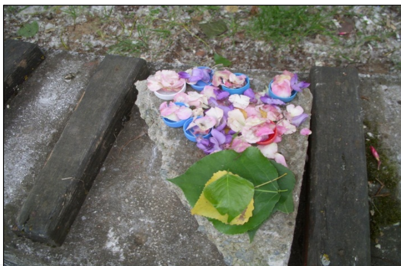
Figure 15. Figure 15. Plant parts are important play materials

Finally, White and Stoecklin (1998), cited the following features that children likes to see in public areas;