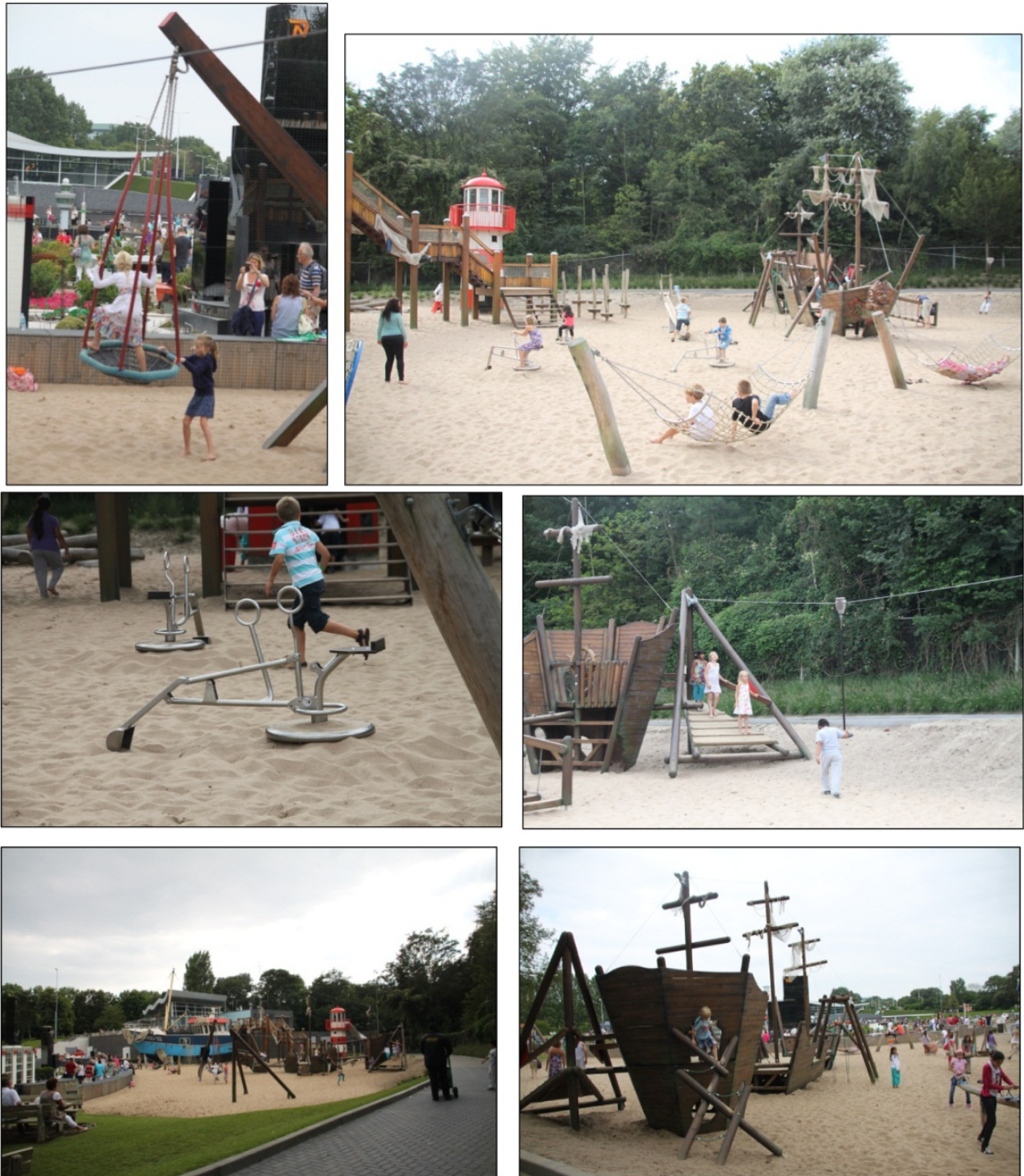
Figure 20. Play space from Den Haag, Netherland