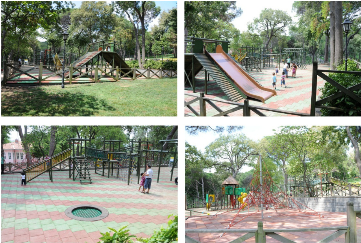
Figure 21. Play space from Istanbul, Turkey