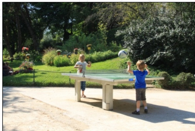
Figure 4. Children use materials in the environments according to their own purposes (Photo Acar, H., Paris, France).

Children use these opportunities according to their own imagination, creativity, or purposes (figure 4).