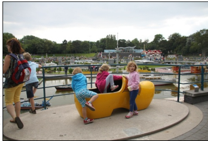
Figure 2. Any object that children can enter might be a play space for them (Photo Acar, H., Den Haag, Netherland).