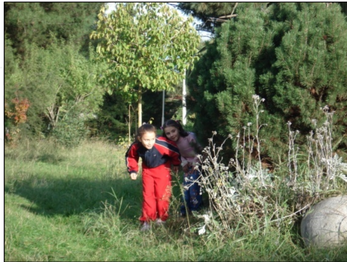
Figure 14. Figure 14. Plants are ideal materials to hide behind

(Moore, 2002). In addition, care must be taken for children's health and safety according to selected species (allergens, toxic, barbed should not be used).