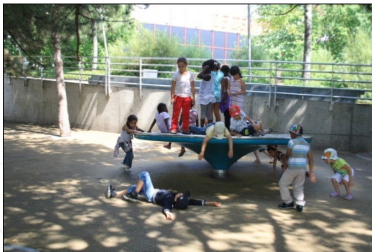
Figure 5. Open spaces provide the opportunity to be together with other children.

Open spaces provide more opportunity than the closed spaces with the materials they have (Heerwagen and Orians, 2002; Day and Midbjer, 2007; Acar, 2009). First of all, these spaces experimentally allow children to contact with their environment, to make observation and to learn natural events (change of the seasons and so on). Also, it helps children to become social because it presents the opportunity of being together with other children (figure 5, 6).