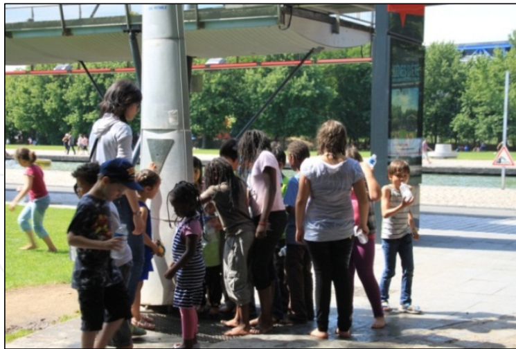
Figure 6. Even a fountain allows children come together, to communicate, to socialize. At the same time helps them to learn issues such as to respect the rights of others and their right to self-defense.