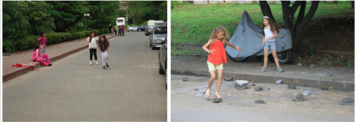
Figure 10. Figure 10. Streets are play spaces for children near their home (Photos Acar, H., Trabzon, Turkey)

both sexes and all age groups. However, streets are thought as a transportation routes used to go from a point to b point or parking areas for vehicles by adults (Moore, 1991).