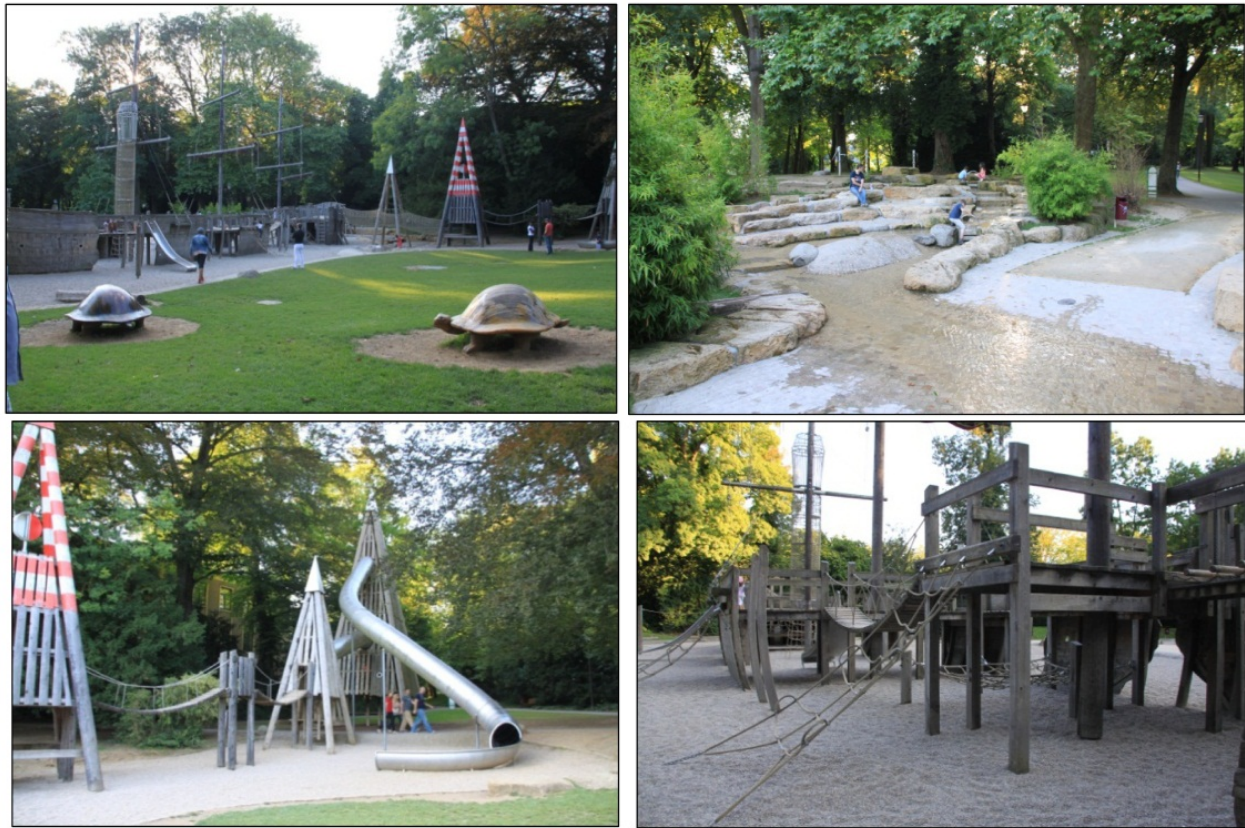
Figure 18. Figure 18. Play space from Luxemburg, Luxemburg