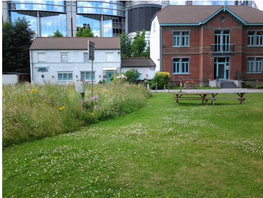
Figure 12. Creating natural areas inside the cities can be effective for bringing together urban residents and nature (photo from Brussels-Belgium taken by Aysel Uslu).

Raising the awareness of biodiversity is an important part of maximizing urban biodiversity conservation.