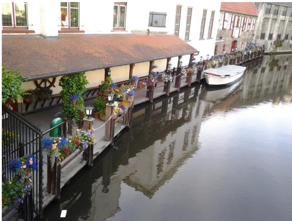
Figure 7. Flowerboxes containing various flowers diverse (photo from Brussels-Belgium taken by Aysel Uslu).

The concerted efforts at various scales on improving urban biodiversity can produce best results. Designing with biodiversity in mind must be an important part of sustainable design strategies at a neighbourhood level such as micro district, subdivision, housing complexes. In small scale, home-owners can take various actions for improving urban biodiversity. It is important that home owners realize that their individual effort can contribute to a larger collective effort that would culminate in the creation of a real biological corridor. Such a corridor can facilitate the movements of several species throughout the city and improve urban biodiversity (Laurence and Palmaerts, 1991; Savard et al. 2000). Plantings on balconies, in window boxes and on roofs beside promote residential gardens including decorative or vegetable gardens can have positive impact on improving urban biological diversity (Figure 7).