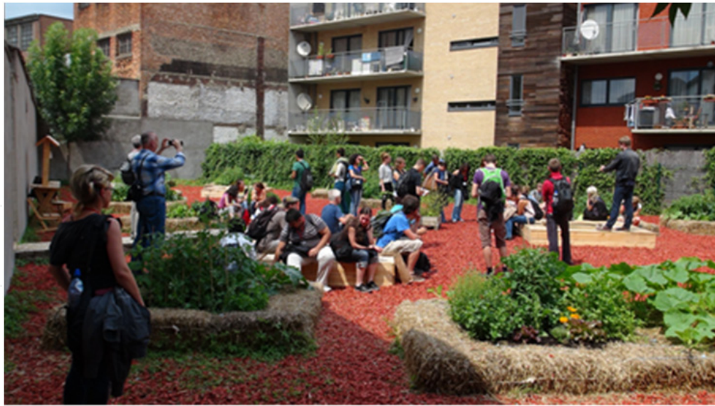
Figure 10. Biodiversity management should create benefits for poor communities and more visible and sensible for urban residents. A sample of edible landscape design in urban area Belgium.

Finally, it must be noted that, creation and improvement of urban biological diversity processes require time. Therefore, the programs and design methods should be based on characteristics of the local ecology considering the time required for each stage. Also, it must be highlighted that, to be successful in conserving biodiversity, the value of nature in public mind must be made clear. Also, by using different levels of environmental education, government raises environmental awareness of urban residents to ensure the next generation life in cities. The reason is that most of the biological diversity restoration and improvement work would not have been possible without the participation of volunteers and urban residents (Figure 11).