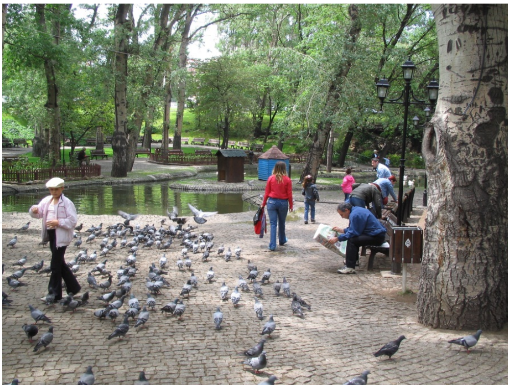
Figure 1. Green areas such as parks can provide interactions between human and nature as well as improving biodiversity (Photo from Ankara-Turkey taken by Aysel Uslu)

The urban environment is ecologically highly dynamic (Gilbert, 1989; Adams, 1994; Savard et al. 2000) and can provide opportunities for improving the biodiversity and ensure beneficial insights into the management of biodiversity in other ecosystems. The existence of urban biodiversity can have positive impacts on quality of life as well as environmental improvement. Green areas such as parks can provide interactions between human and nature (Figure 1). It can also influence the form of the city and its inhabitants. Furthermore, the conservation of urban biodiversity is an important issue in managing urban landscape especially in mega-cities (Qureshi & Breuste 2010).