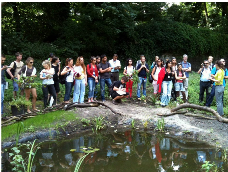
Figure 11. Promoting awareness of biodiversity to local communities (photo from Brussels in Belgium taken by Oguz Yilmaz)

Finally, it must be noted that, creation and improvement of urban biological diversity processes require time. Therefore, the programs and design methods should be based on characteristics of the local ecology considering the time required for each stage. Also, it must be highlighted that, to be successful in conserving biodiversity, the value of nature in public mind must be made clear. Also, by using different levels of environmental education, government raises environmental awareness of urban residents to ensure the next generation life in cities. The reason is that most of the biological diversity restoration and improvement work would not have been possible without the participation of volunteers and urban residents (Figure 11).