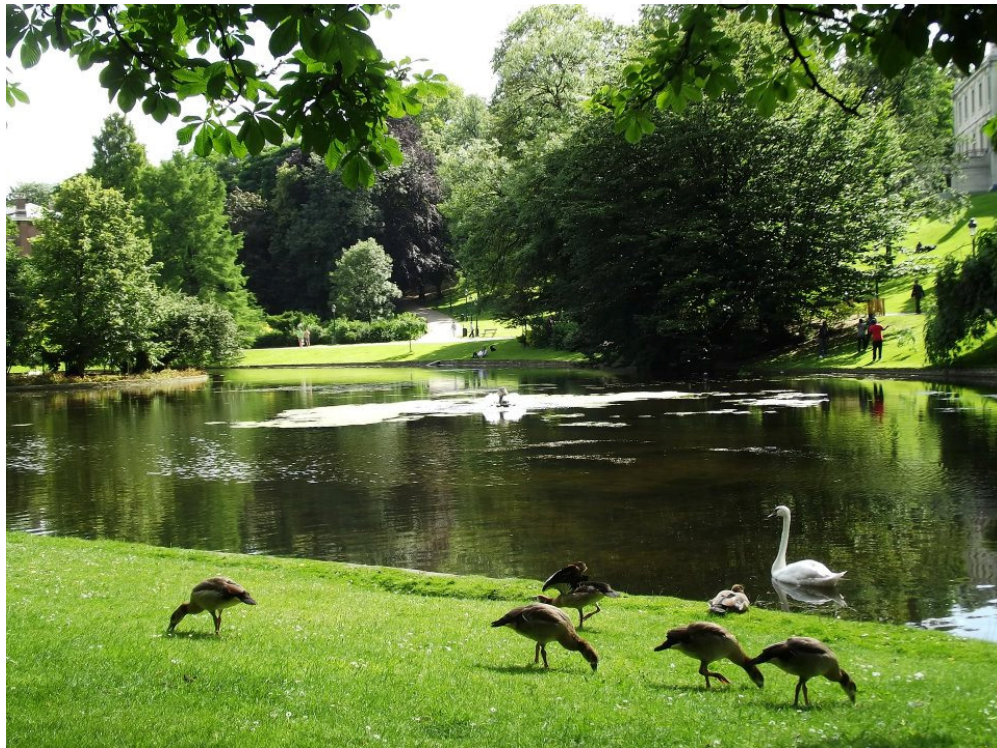
Figure 2. Waterways in urban areas as opportunity for promoting biodiversity (photo from Brussels-Belgium taken by Aysel Uslu)

Streams and other waterways as natural corridors in urban areas are another opportunities for promoting biodiversity. If these corridors are well managed, they can improve biodiversity not only in the habitats beside the land but also can have positive effects on the proliferation of aquatic species (Figure 2).