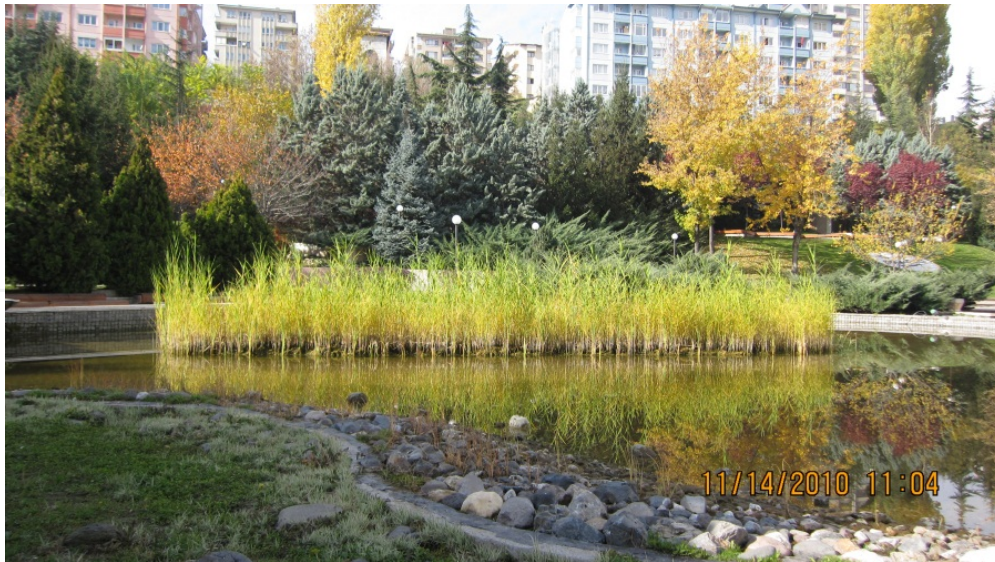
Figure 9. Bringing different type of habitats inside the urban park- Ankara.

must be identified and the methods of utilizing these plants in the urban area should be developed.