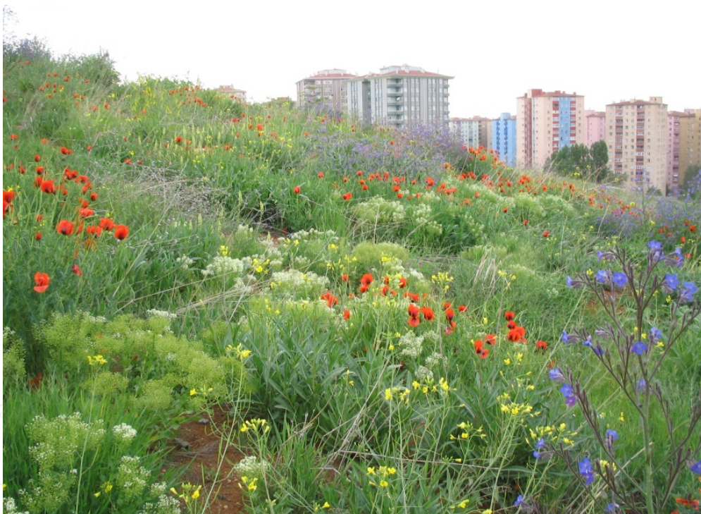
Figure 5. An area with wildflower inside the city borders is valuable for urban biodiversity (photo from Ankara-Turkey taken by Aysel Uslu).

Today, there are many examples of strategies for bringing cities and nature more closely all over the world. The use of native species for ornamental purposes, establishment of conservation areas, revitalization of the nearby water river basin, planning for tree lined streets and linear parks are some of these strategies. European cities offer many examples of these kinds of efforts to incorporate green features and nature into the design of the built environment in urban areas.