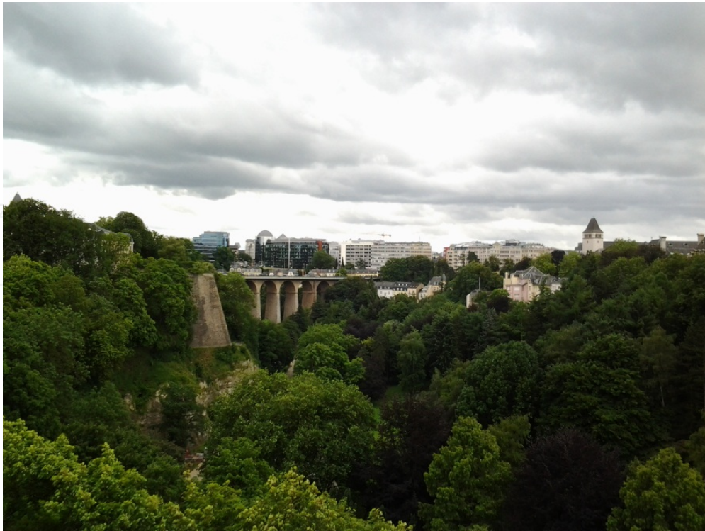
Figure 3. Natural green spaces can support the life cycle of local species (photo from Luxembourg taken by Aysel Uslu).

Also there are series of open public areas inside the cities that have potential for improving biodiversity. If these areas including; parks and public gardens, outdoor sports activity areas, playground, squares, hobby gardens and urban farms are well-designed and managed, then they will provide life habitats for many plant and animal species.