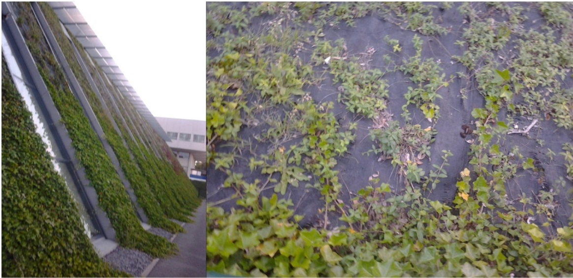
Figure 4. New technologies for maintaining vegetation species on the buildings walls (photo from Brussels-Belgium taken by Aysel Uslu).

that outcomes of urbanization influences on the biodiversity can have positive impact on quality and quantity of urban biodiversity.