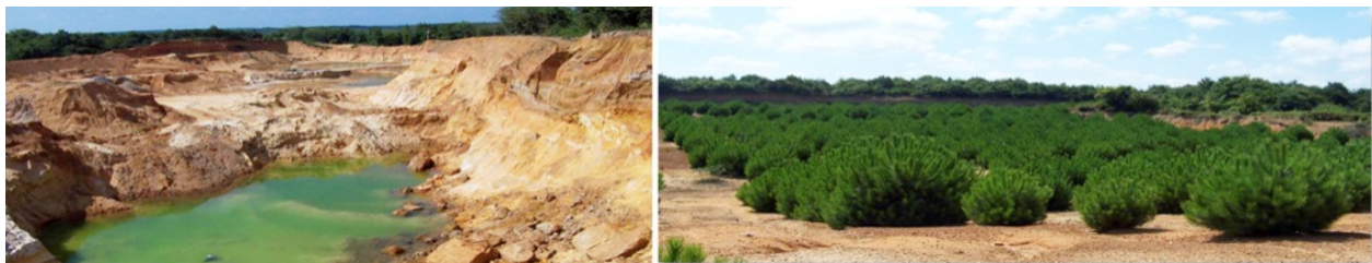
Figure 5. Afforestation operations in Şile, İstanbul (Şile Forestry Operation Directorate 2012)

In Turkey, reclamation of abandoned mine sites is generally carried out in the form of afforestation (Figure 5 and 6).