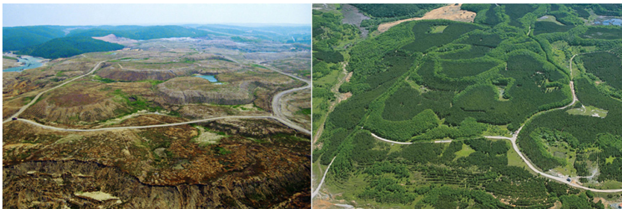
Figure 6. Afforestation in Ağaçalı, İstanbul (Kutorman 2012)

Rehabilitation and restoration operations in most of the abandoned coal mine areas are conducted by Turkish Coal Enterprises (TKİ). According to General Directorate of Turkish Coal Enterprises (2011), between 1991 and 2011, nearly 7.3 million trees in various species [stone pine ( Pinus pinea ), black pine ( Pinus nigra ), red pine ( Pinus brutia ), cypress ( Cupressus sp.), cedar ( Cedrus sp.), horse chestnut ( Aesculus hippocastanum ), black locust ( Robinia pseudoacasia ), tree of heaven ( Ailanthus altissima ), oak ( Quercus sp.), maple ( Acer sp.), ash ( Fraxinus sp.), etc.] were planted on 4455 hectares of post-mining lands in various establishment directorates of TKİ (Figure 7).