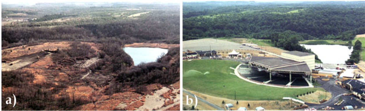
Figure 4. A site reclaimed by Starvaggi Industries in West Virginia is developed into the Star Lake Amphitheater: a) post-mining landscape, b) after the reclamation (Mineral Information Institute 2012)

In Turkey, reclamation of abandoned mine sites is generally carried out in the form of afforestation (Figure 5 and 6).