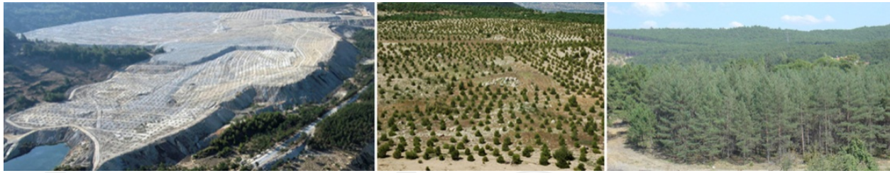
Figure 7. Afforestation of soil waste dumps by the establishment directorates of TKİ (General Directorate of Turkish Coal Enterprises 2011)