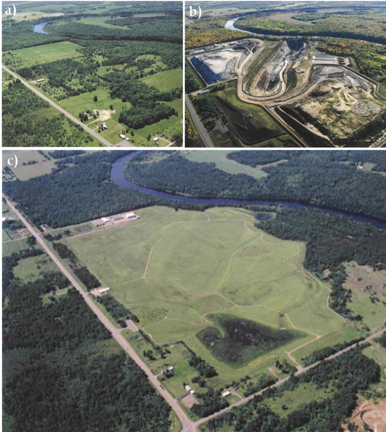
Figure 2. Flambeau Mine Site: a) before mining (1991), b) during mining (1996), and c) after mining (2002) (Fox 2002)

pit, which was substantially complete by the fall of 1997. During 1998, the contours of the site were reestablished, topsoil replaced, wetlands constructed, and seeding and planting were initiated. The majority of seeding and planting was completed by year and 1999. Additionally the design constructed hiking, biking and equestrian trails for public recreational use. The pre-mining, active mining, and reclaimed site are shown in Figure 2 for a chronological comparison (Fox 2002 ; Cherry 2008).