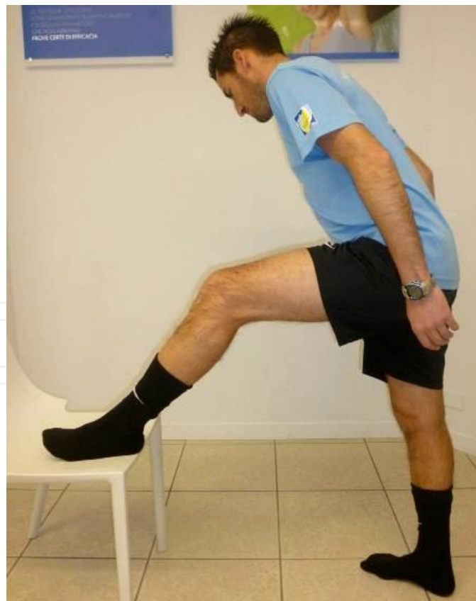
Figure 6. Hamstring stretch: swing phase position with slow side to side rotation and flexion extension of the knee.