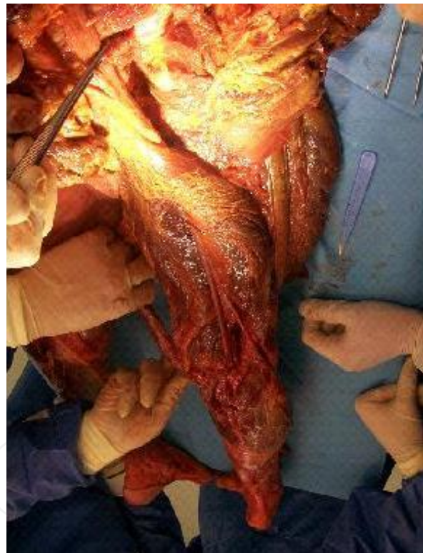
Figure 1. The cadaver anatomy hamstring

Possible signs of swelling and ecchymosis may arise a few days later the injury and consequently may not be noticed at the initial examination (Wood et al., 2008; Askling et al., 2006).