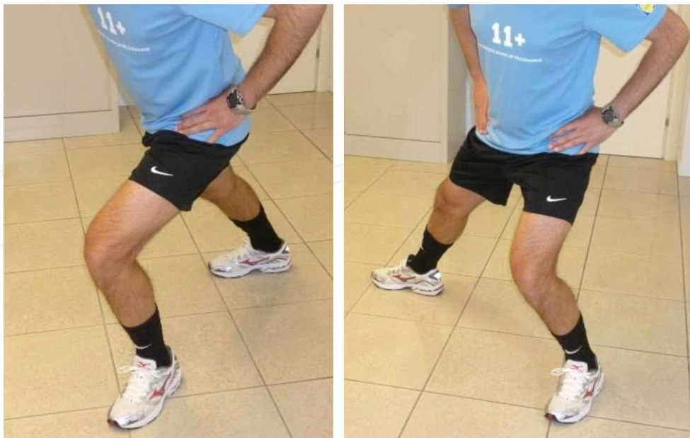
Figure 11. Lunges in all planes with return to start position. Increasing the length of the step and / or the execution speed of each sitting to vary the training stimulus.