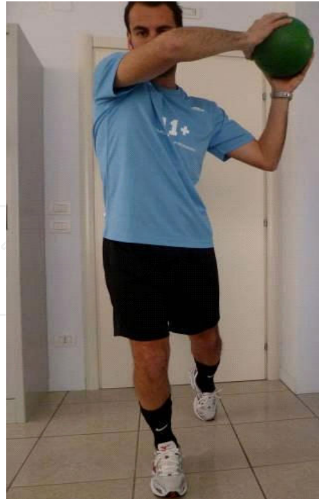
Figure 4. The patient should rotate the trunk as for kicking with the aim to train the core musculature.