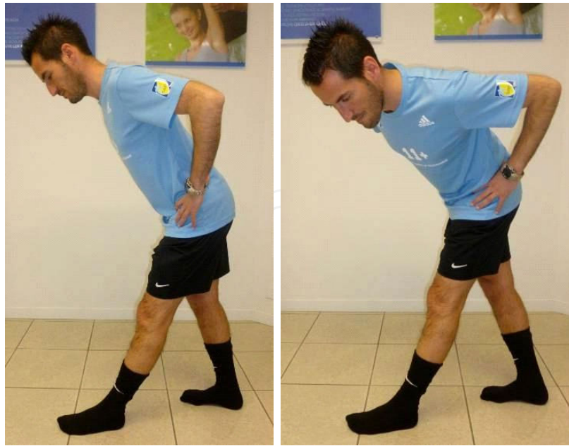
Figure 5. Walking hamstring stretch: the patient is in standing position. The injured limb is extended. Trunk flexion to stretch the hamstring muscles.