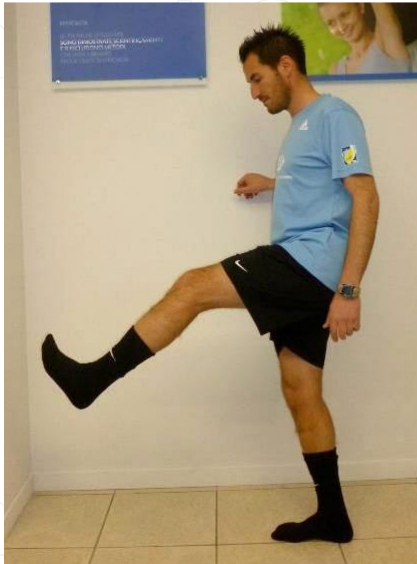
Figure 8. Foot catch exercise. The athlete stands parallel to a wall, and simulates the swing phase of walking at the first phase and after of the running. During the swing phase, the athlete performs a quick quadriceps contraction and then attempts to catch or stop the lower leg before reaching full knee extension by a hamstring contraction. In first phase with a little hip and knee extension. In a second phase increase hip and knee extension and the velocity.