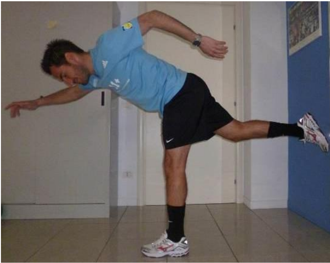
Figure 10. The patient is in an upright position on a single leg: flexion of the trunk with arms that push forward to increase the difficulty.