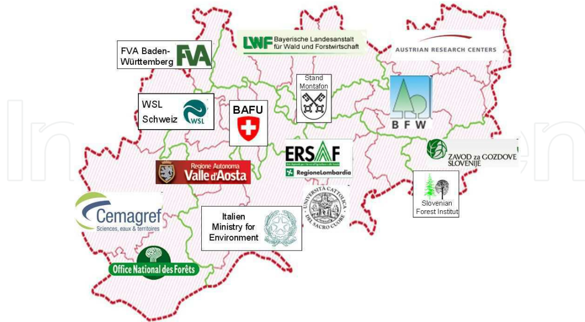
Figure 1. Geographical distribution of the partner institutions of the Interreg project “MANFRED - Management strategies to adapt Alpine Space forests to climate change risks”.

The forests have a dual function within climate change. They are contributing to the mitigation of climate change, and their adaptation to climate change effects ensures their sustainable development under future site conditions. When the conservation of the huge carbon stock of forests in the Alpine Space is on the agenda, it is necessary to enhance the resilience of forests. Many forests, particularly in mountains, are going to benefit from climate change effects in the near future. Their productivity is currently limited by the duration of the growing season, which is expected to be elongated in the future. However, climate change is expected to manifest itself in many ways and the increase in the temperature is only one aspect. The rising CO 2 level affects the growth rate as well and altered temporal patterns of drought, mortality, and disturbances are to be taken into account. Moreover, the nitrogen supply has been increasing in the last decades and may in some regions exceed the demand of forests [10, 11]. Superimposed on these effects are potentially adverse effects such as extreme meteorological events, ecosystem disturbances, air pollution, and an increasing pressure from pests and pathogens on forests.