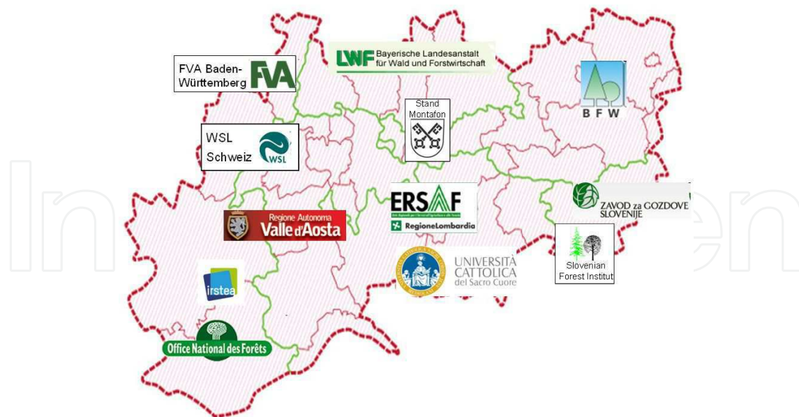
Figure 1. Geographical distribution of the partner institutions of the Interreg project “MANFRED - Management strategies to adapt Alpine Space forests to climate change risks”.

The transnational case study Slovenia-Austria covers a region with physico-geographical similarities, that has been divided by politics in the past (sites Solčava-Luče, Ossiacher Tauern, Dobrova in Figure 2). The regions have in common that timber production is the main target of forestry. Differences in the forest-management practice are visible. Slovenia has since long adopted the concept of continuous-cover forestry and is renown for its shelter-wood forests. In Austria, clear-cutting is still widely practiced within the regulations of the Austrian Forest Act. Presently, no severe challenges for practical forestry are identified, but the consequences of climate change on forests are only vaguely known [4]. In the case study area an intensive exchange of views and experiences was conducted.