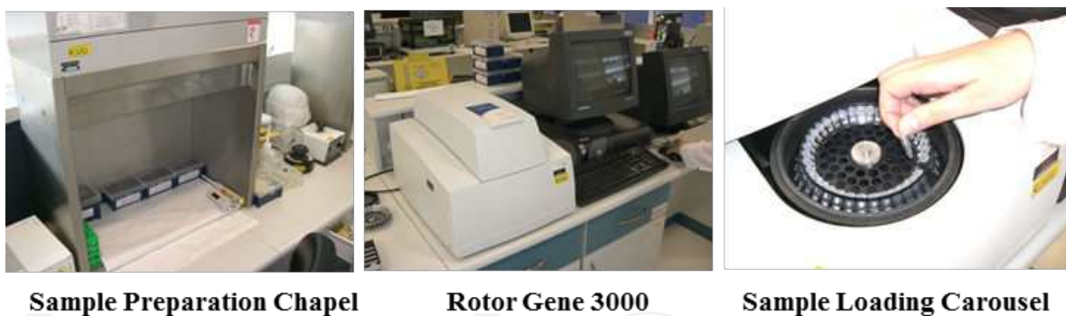
Figure 1. Experiments Environment: Sample Preparation Chapel and Rotor Gene 3000

The Prothrombin detection probe, which was complementary to the wild-type allele, was 3'-labeled with 6-carboxy-4',5'-dichloro-2',7'-dimethoxyfluorescein (JOE). The anchor probe was 5'-labeled with 6-carboxytetramethylrhodamine (TAMRA) and phosphorylated at its 3' end. About 240 ng of genomic DNA in a final PCR volume of 25 \mu L were amplified and detected in the Rotor-Gene 3000 (Corbett Research, Australia), as shown in Figure 1.