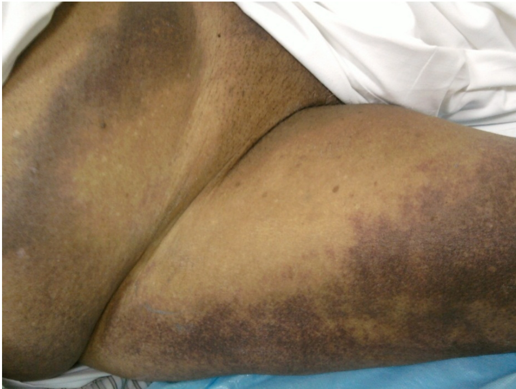
Figure 1. Ecchymosis of the right thigh and lower abdominal wall.