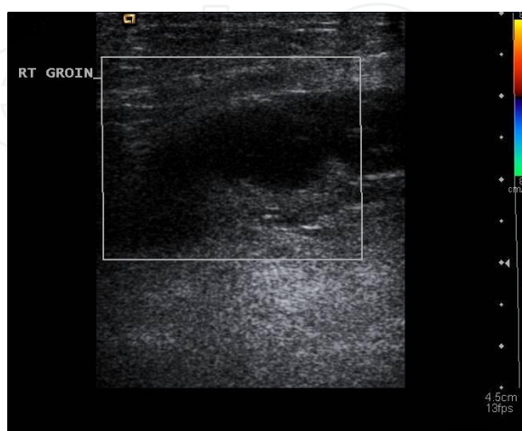
Figure 5. Successful post compression thrombosis of the PSA &AVF.

The only limiting factor in USGC method is the time it takes to induce thrombosis to close the PSA or AVF tract [13]. Patient may experience intra-procedural pain which responds to intravenous analgesia [12]. Complications are rare and include vasovagal reactions, PSA rupture, skin necrosis and DVT [13].