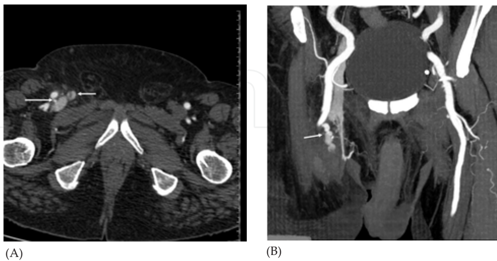
Figure 4. (A) CT angiography axial image depicts a thin linear communication (long arrow) between the posterior wall of FA and FV with opacification of the latter and the proximal great saphenous vein (short arrow); and (B) Coronal