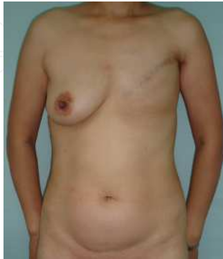
Figure 6. Pre-operation

Upper and lateral part of the flap were de-epithelialised and placed under the local flap to recreate a natural looking chest wall and anterior axillary fold. New nipple was reconstructed with modified “arrow” flap, and the areolar was made by a tattoo. [Fig 6,7]