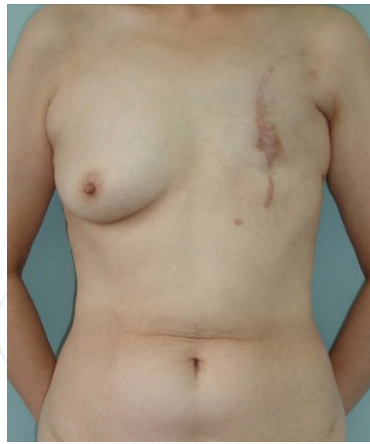
Figure 8. Pre-operation