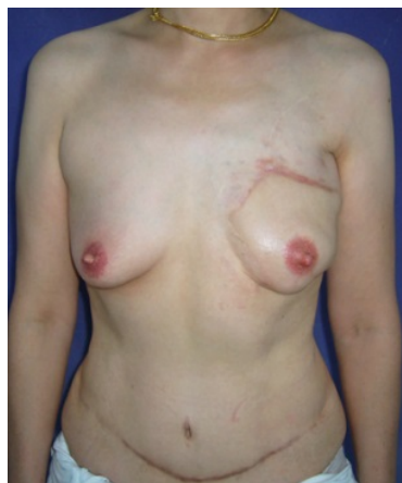
Figure 9. Post-operation