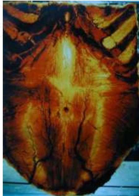
Figure 2. Transparent Morphology specimen of the Thoracoabdominal Wall

2) There were two accompanying veins found with communicating branches. No valve had been found inside the internal mammary vein, intercostal vein and communicating branches. The IMV retrogradely drained distally from two direct ways, via the communicating branches to the other IMV and then to the subclavian vein and via the intercostal vein to the posterior intercostal vein and then to the vena azygos [Fig.2].