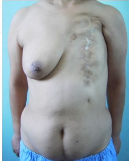
Figure 4. Pre-operation

ends of internal mammary vessels (proximal and distal) all by end-end was performed for left breast reconstruction. Upper and lateral part of the flap were de-epithelialised and placed under the local flap to recreate a natural looking chest wall and anterior axillary fold. Six months after the operation, nipple reconstruction with modified "arrow" flap was made. [Fig 4,5]