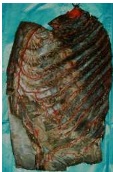
Figure 1. The anastomoses among DSEA,m.p.a. and i.c.a;

Results: 1) The IMA was found originating from the subclavian artery, then running along the sternum, and segmentally connecting to the intercostal arteries from the aorta. It was divided into two ends at the sixth intercostal space as the deep superior epigastric and musculophrenic arteries. The musculophrenic artery was found linked to the abdominal aorta by anastomosed with superior and inferior phrenic arteries. This is the anatomic basis of distal end of IMA as one recipient supply artery, which means that, if the IMA was cut off near the third intercostal space during the clinical procedure, the retrograde IMA flowed distally from the extensive anastomoses among the intercostal, musculophrenic and deep superior epigastric arteries.[Fig.1].