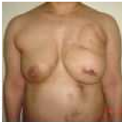
Figure 5. Post-operation

Typical case 4: A forty-two-year-old female, five years after the left modified radical mastectomy and radiation therapy. Her right breast was big, with abdominal wall not thick enough having a transverse Caesarean scar.