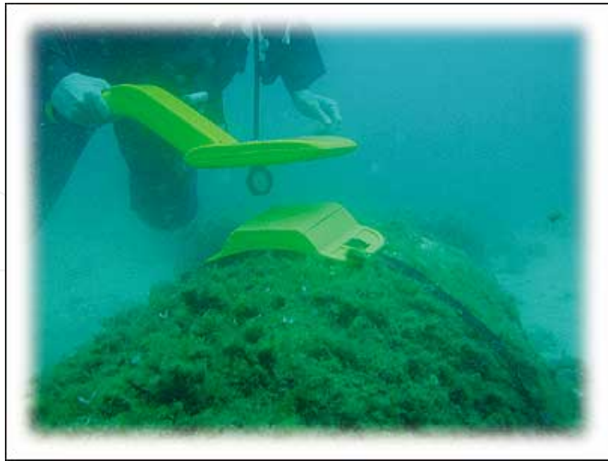
Figure 2. The Enertag system for the pipeline monitoring