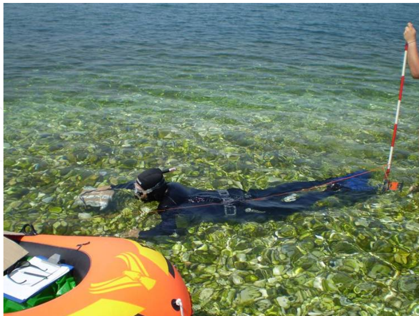
Figure 4. A moment of the localization operations