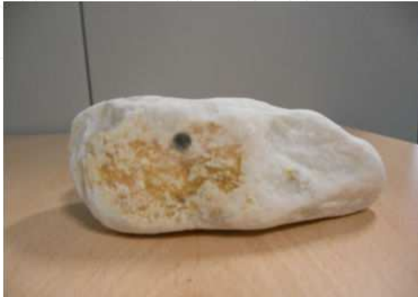
Figure 3. A Smart Pebble. On its surface is possible to notice the hole housing the transponder

The first experimentations on the Smart Pebble system were carried out in 2009 and this solution has been since then employed in several on-site applications on different beaches in Italy. The effective use of the system has roughly confirmed the results recorded in the laboratory tests: during the localization process, the transponders embedded inside the pebbles were localized even from distances higher than 50cm.