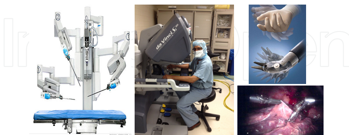
Figure 3. Robotic approach to lung resection is the latest evolution in lung resection. The surgeon operates from a remote location using the console to control the robot that is 'docked' to the patient. The instrument articulations are such, it is more versatile than the human hand, allowing detail dissection in small spaces, however lacks the tactile sensation.

The late 1990's saw the development of robotic surgical systems with Intuitive's da Vinci system. The technique utilizes instruments that hinge on a chest wall fulcrum and operate within a cone. The da Vinci system uses multiarticulated instruments that provide seven degrees of rotational freedom, akin to a surgeon's wrist and can be placed exactly where dissection is needed with three-dimensional optics. The skin incisions and trocars are not appreciably different from VATS but the mobility at the end of the instrument is. Da Vinci can be used to retract, grasp, cut, ligate and suture. There is however absence of haptic feedback and therefore tension of tissues is determined solely from visual input (Figure 3).