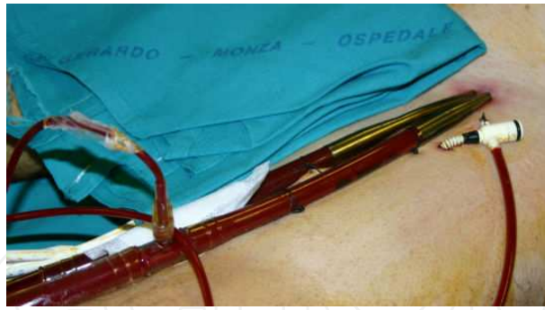
Figure 6. Distal leg perfusion to restore the blood flow.

Some Authors [25] suggested to insert a catheter for a distal perfusion if the mean pressure of the superficial femoral artery is lower than 50 mmHg.