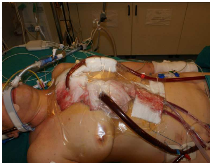
Figure 3. Central cannulation for V-A ECMO

The open surgical approach is considered for patients with severe peripheral vascular disease or for patients with postcardiotomy syndrome or failure of weaning from cardiopulmonary bypass [23, 24] (Figure 3). The open or central cannulation has more complications such as bleeding, infections, and mediastinitis.