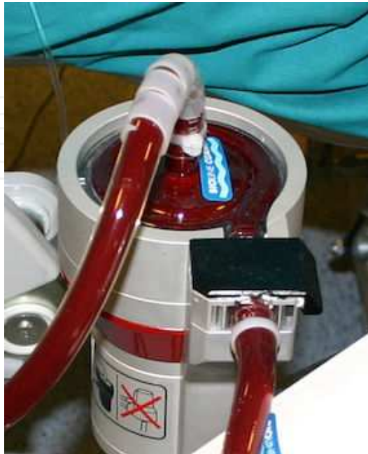
Figure 8. Centrifugal pump.

the pump head and this negative pressure pulls blood into the pump and then the blood is pushed towards the oxygenator.