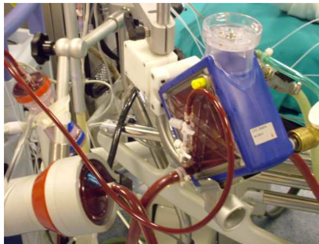
Figure 9. V-A ECMO circuit with polymethylpentene oxygenator (blue case)

Recently a new miniaturized system for V-A ECMO was introduced in the clinical practice. The system has the console directly connected with the oxygenator and the blood pump, which are integrated to each other. The console has a touch screen where is possible to monitor continuously several parameters such as hematocrit, hemoglobin, SVO 2 , resistance at the inlet and the outlet of oxygenator and the pressure drop (Figure 10).