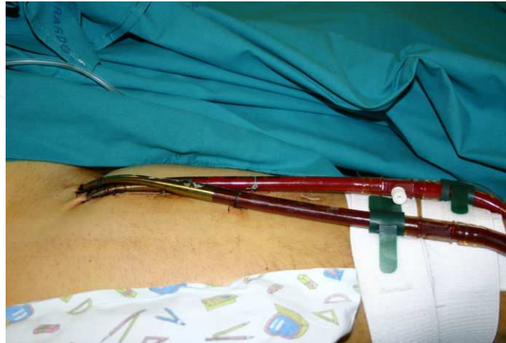
Figure 2. Peripheral cannulation for V-A ECMO.

Cannulation is one of the most challenging aspects of ECMO. Peripheral percutaneous approach [6, 21] is the most used in cardiogenic shock and cardiac arrest [7, 22] because is quicker with less bleeding complications and easier decannulation. (Figure 2).