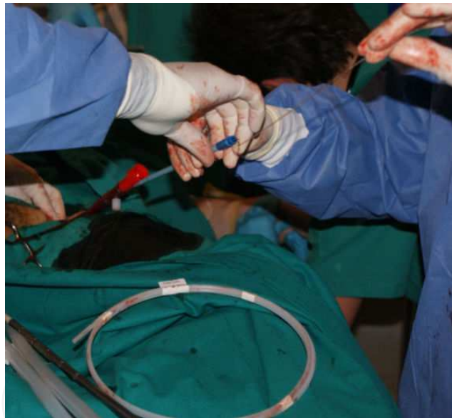
Figure 5. Percutaneous cannula insertion by Seldinger technique.

The size of the cannulas depends on the size of the patient; usually the arterial cannula ranges between 17 Fr to 21 Fr and the venous cannula ranges between 21 Fr and 25 Fr. Cannulas of sufficient size are required to support high blood flow with low resistance. Local complications, particularly at the site of peripheral insertion of VA-ECMO can occur, of which the most concerning is leg ischemia. For this reason all attempts the limb perfusion is restored, after noted the absence of anterior and posterior tibial artery flow, by inserting a 9-Fr catheter distally to the arterial cannula by means of vascular ultrasound scan as soon as possible after ECMO implantation (Figure 6).