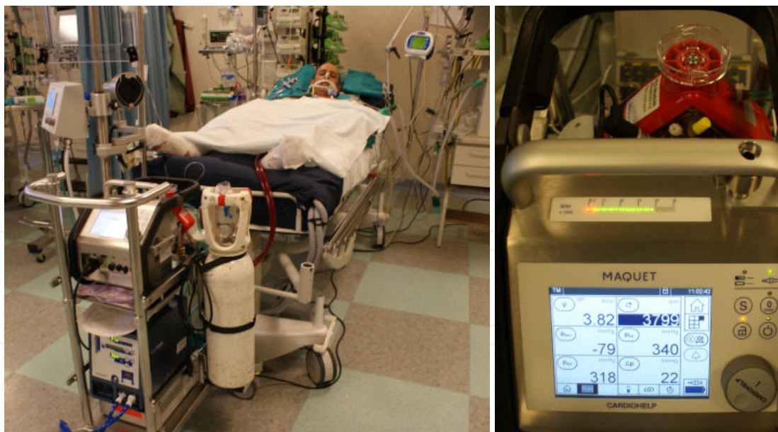
Figure 10. On the left the miniaturized V-A ECMO system (Cardiohelp by Maquet); on the right the particular of console.

Recently a new miniaturized system for V-A ECMO was introduced in the clinical practice. The system has the console directly connected with the oxygenator and the blood pump, which are integrated to each other. The console has a touch screen where is possible to monitor continuously several parameters such as hematocrit, hemoglobin, SVO 2 , resistance at the inlet and the outlet of oxygenator and the pressure drop (Figure 10).