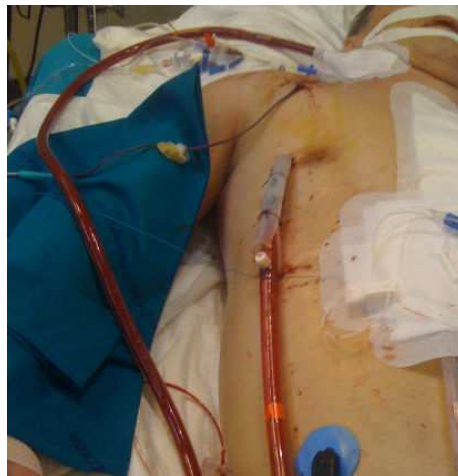
Figure 7. Cannulation of right axillary artery (tube on the right). Cannula is tunneled below the skin to protect by accidental trauma.

Alternative arterial approach, such as axillary arterial cannulation, has been reported [26] (Figure 7).