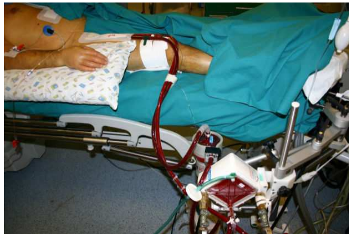
Figure 1. Patient supported with peripheral V-A ECMO

The veno-arterial ECMO configuration is a tubing loop with a venous arm connected to a venous cannula to allow the venous blood drainage and an arterial arm to return back the oxygenated blood inside the patient's circulatory system. This mode provides both cardiac and respiratory support and can be achieved by either peripheral or central cannulation (Figure1).