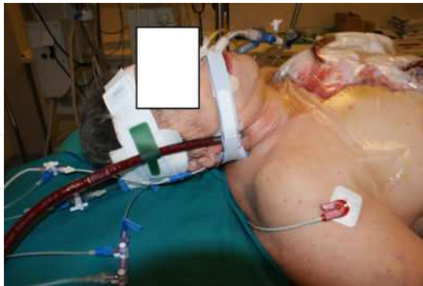
Figure 12. The cannula is inserted in the right jugular vein and advanced up to the main arterial pulmonary trunk.

Other techniques of LV decompression have been described such as the use of Pulse-Cath [31], Insertion of a pigtail inside the LV through the aortic valve [32], use of a transeptal atrial cannula [33].