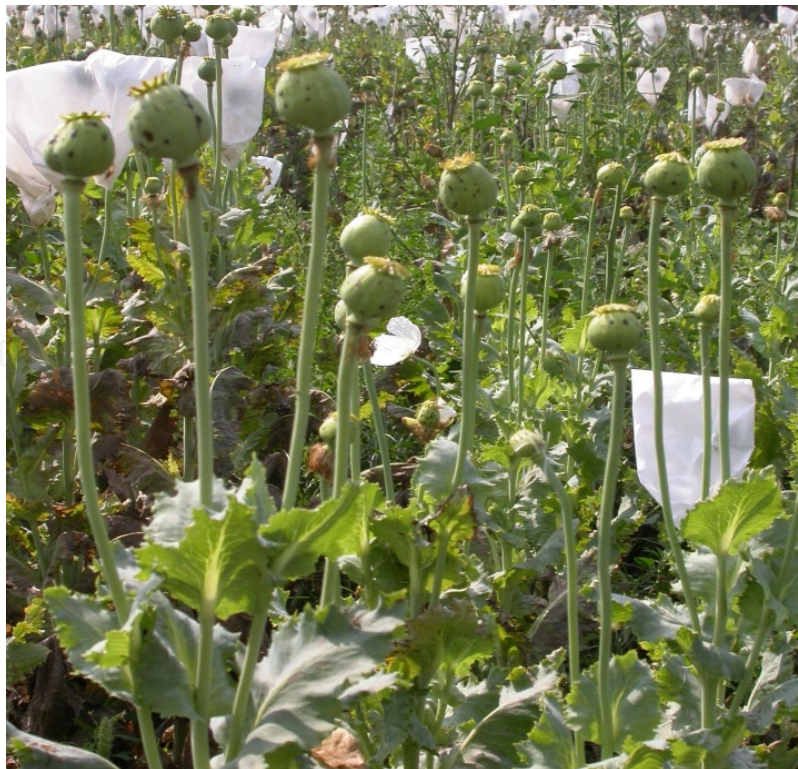
Figure 4. Field view of developed high thebaine lines.