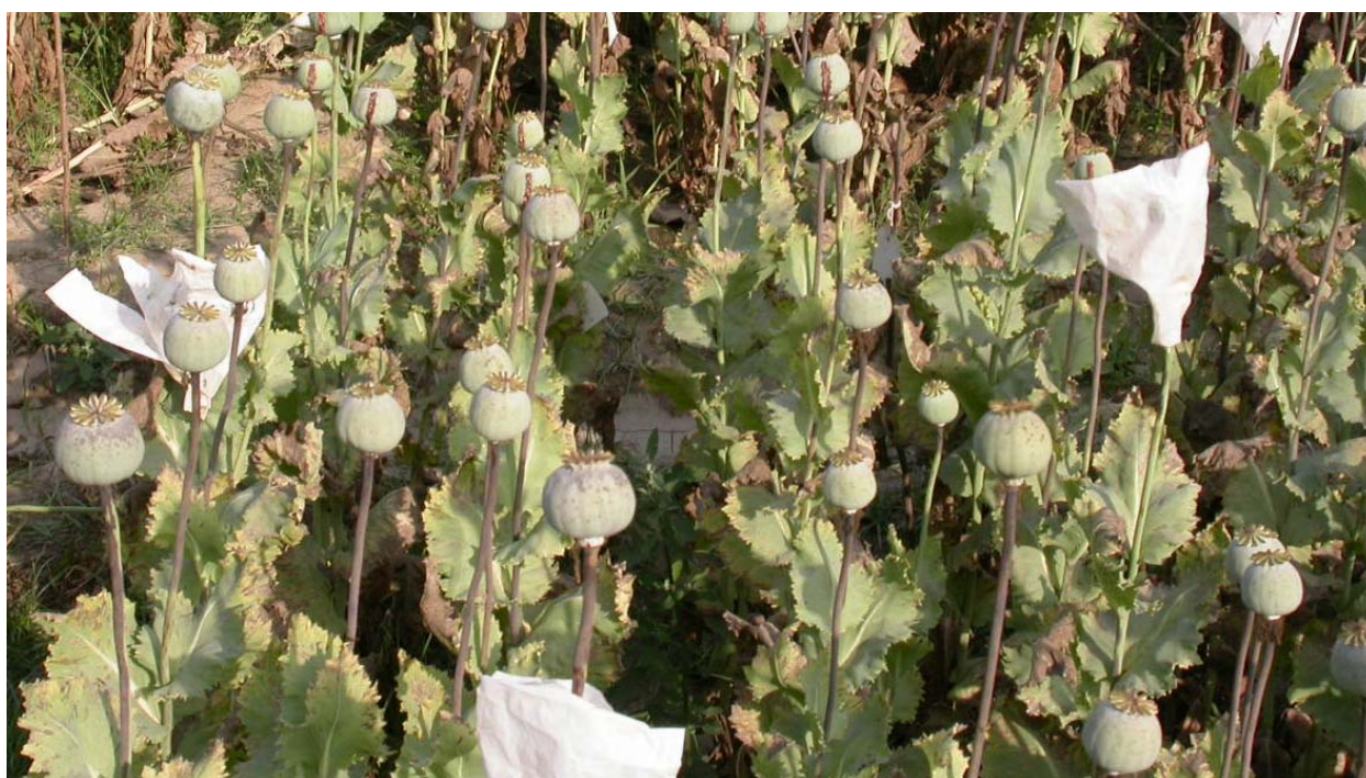
Figure 3. Field view of developed high yielding variety "Madakini".