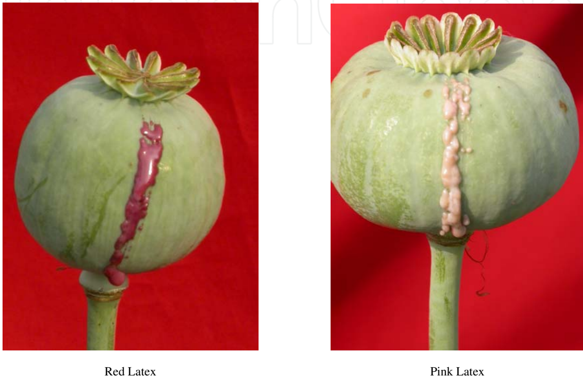
Figure 1. Capsule having brown and pink latex in opium poppy.

ages. The seeds of opium poppy are highly nutritious as it contains protein upto 24% and other vital nutrients beneficial for human health. The leaves of the plant are used as vegetable in some places in the world. The seed oil of poppy is also important for health point of view due to having high percentage of linoleic acid (68%) which helps in lowering blood cholesterol level in human body and is also used in the treatment of cardiovascular diseases in human system [2,3].