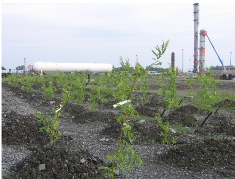
Figure 8. Phytoremediation using willows on a former oil refinery around Montreal

Phytoremediation using willows is becoming an increasingly popular alternative approach to decontamination, and several studies and pilot projects are underway. Willows have been used successfully to treat highly toxic organic contaminants such as PCBs, PAHs, and nitro-aromatic explosives [87]. Similarly, willows, in particular S. viminalis and S. miyabeana , have been shown to accumulate Cd and Zn in their stems and leaves while sequestering Cu, Cr, Ni and Pb in their roots [85,88,89,90]. In previous studies, the efficiency of willows in short-rotation intensive plantation for the elimination of heavy metals contained in wastewater sludge has been investigated [28, 59, 90]. We have also found that willow may be useful for improving sites polluted by mixed organic-inorganic pollution [91] (Figure 8).