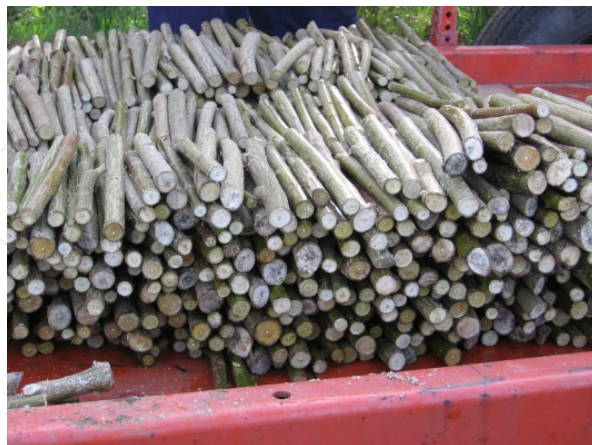
Figure 2. Willow cuttings before planting

wood) are selected to prepare cuttings. Tips of stems bearing flower buds are first discarded. Then the rest of the whip is cut into 20-25 cm lengths using an adapted rotary saw and stored in boxes, ready to be planted (Figure 2).