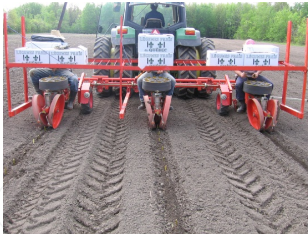
Figure 1. Willow planting machine operating on 3 rows simultaneously

Planting material consists of dormant willow stem sections, either rods or cuttings, depending on the planting machinery to be adopted. In some countries, for example in the UK and in the USA, 'step planters' are the most commonly used machines. Willow rods 1.5-2.5 m long are fed into the planter by two or more operators, depending on the number of rows being planted. The machine cuts the rods into 18-20 cm lengths, inserts these cuttings vertically into the soil and firms the soil around each cutting. Step planters have been calculated to cover 0.6 ha/hr in a UK study. [31]. In Quebec, the most common planting machine is a cutting planter that uses woody cuttings (20-25 cm long) and may operate on 3 rows simultaneously (Figure 1).