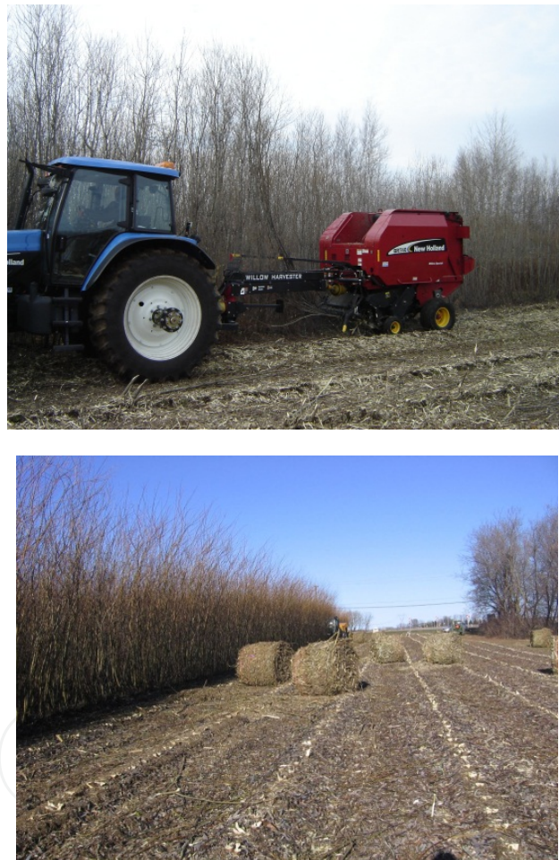
Figure 6. Willow cutter-shredder-baler harvester operating in Quebec

A third harvest system recently developed in Canada, mainly adapted to willow short-rotation coppice, is a cutter-shredder-baler machine that performs light shredding and bales willow stems [22], producing up to 40 bales \text{hr}^{-1} (20 t \text{hr}^{-1} ) on willow plantations (Figure 6).