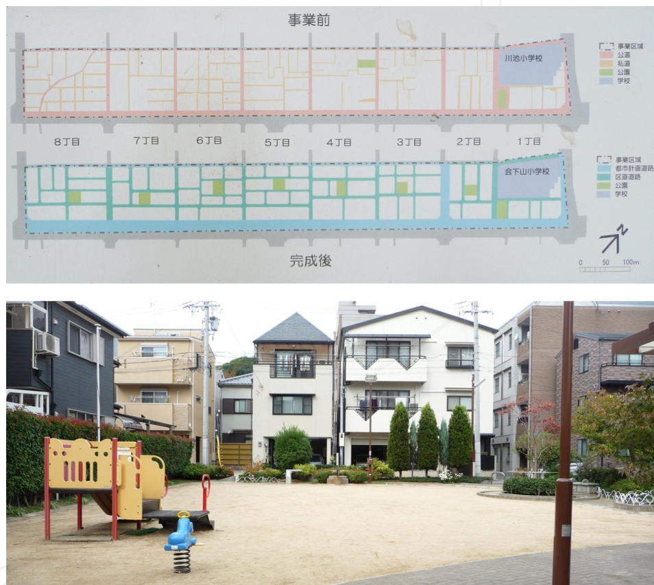
Figure 5. Photo of maps of Matsumoto showing parks before and after in each of the chomes; image of one of the pocket parks.

Suburban parks want to be all things to all people: to do this they need to be a size that can reflect the needs of its catchment of population and fulfil recreational / civic roles. What if they don't? What if they are just there to provide open space, and what if they are just there as a symbol of the neighbourhood and its legibility. The pocket parks in Matsumoto (see figure 5) assume this role, and they do it not by concentrating the essence of the neighbourhood in one place, but by creating 10 more or less identical parks in 10 more or less identical chome, in a necklace that threads its way across the neighbourhood.