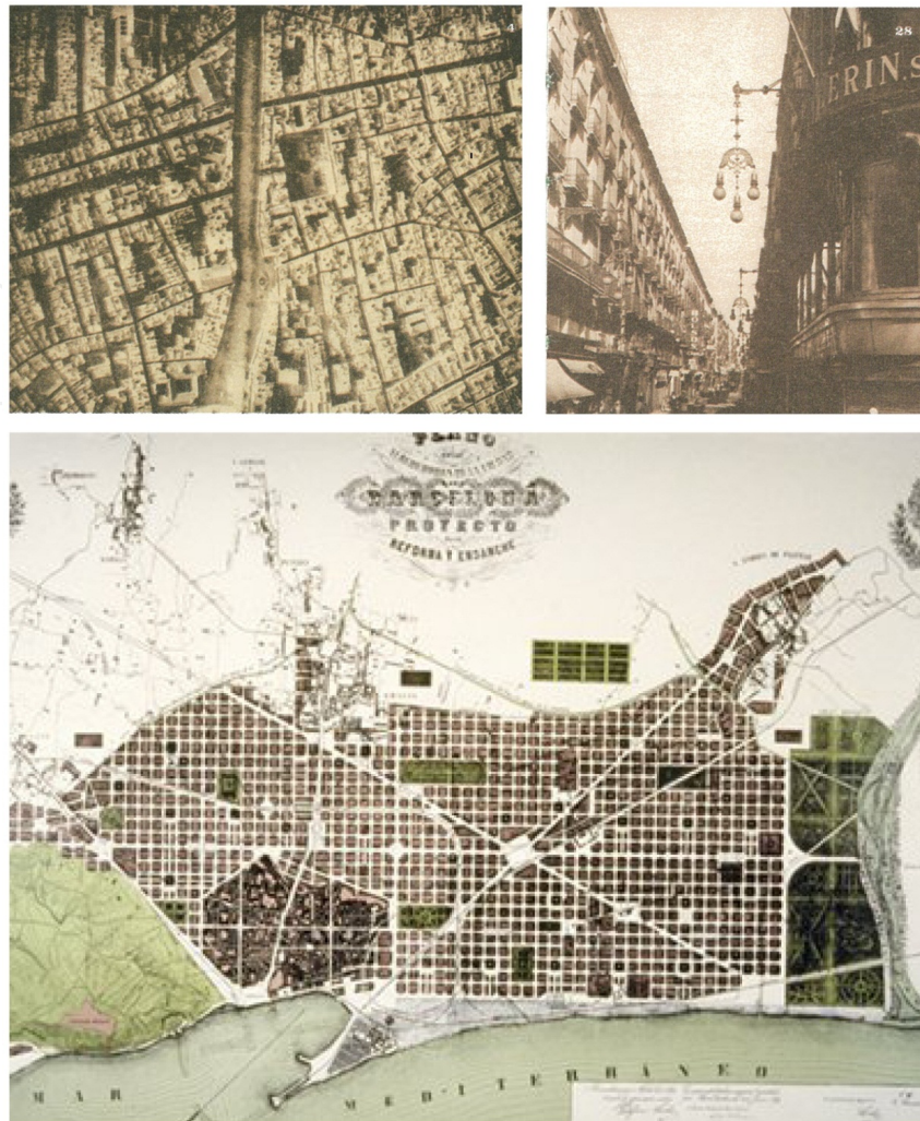
Figure 1. Carrer de Ferran, clockwise from top left: the new street cuts horizontally through the old city; street view; and the street forms the plumb line for the Cerda plan of Barcelona.