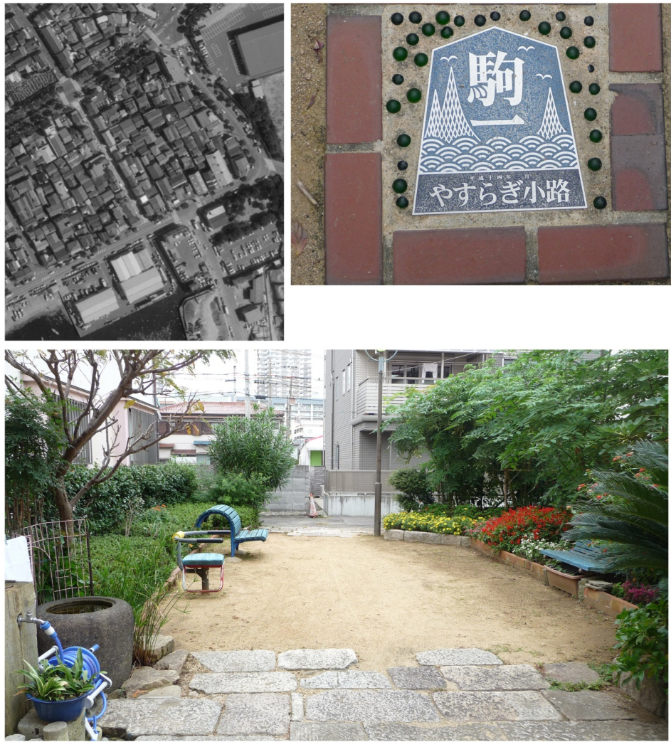
Figure 7. Aerial photo of cho pre earthquake; pavement signage and photo of pocket park established after earthquake destruction left vacant space.

not been exposed before. Some of the traditional residential areas of Shin-nagata were left intact by the earthquake, and after some repair to building stock the area more or less continued to operate as it had. No need to intervene? Perhaps not. But one of the legacies that the earthquake left was an understanding of why open space was important. It was something to be treasured. But there was no room for park in a traditional neighbourhood with multiple ownerships. The only open space in many of these traditional places was disused plots not much bigger than 400metres square, which generally felt 'unhealthy... unattractive... unsafe... insecure... inactive'. [47] The community in cho 1 chome rehabilitated their alleyways with signs for safety and developed a pocket park in one of the disused lots to amplify the qualities of living in a traditional neighbourhood place, and feeling safe (see figure 7).