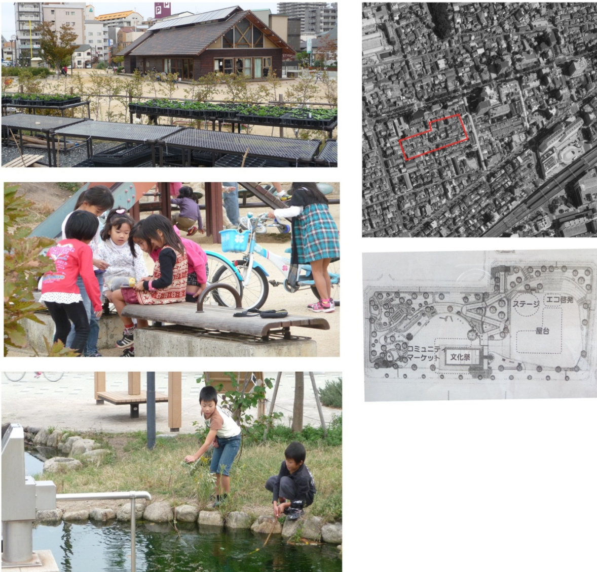
Figure 4. Rokko Kaze No Sate Koen: clockwise from top right: Aerial image of Rokko michi before the earthquake, showing location of future park; photo of plan of park; children playing beside water pump; children playing beside seat which has potential to act as toilet; vegetable gardens and community centre.

Is it a short lived over reaction to a crisis? Maybe, but, because it also tells the story of what these people experienced, why this place is significant, and how it serves as a physical memorial of the crisis that passed, it embodies the grieving process of the community. The park's innovation is not in the stylistic physical detail, but in how it has intensified the recreational and social programmes of a community in a small park. It is another way of thinking what a suburban park's role might be in Japan. The park needs to embody memories as well as Arcadian and civic interventions to make a place resilient. In doing so it liberates the neighbourhood of institutional overtones and allows adaptation to take place.