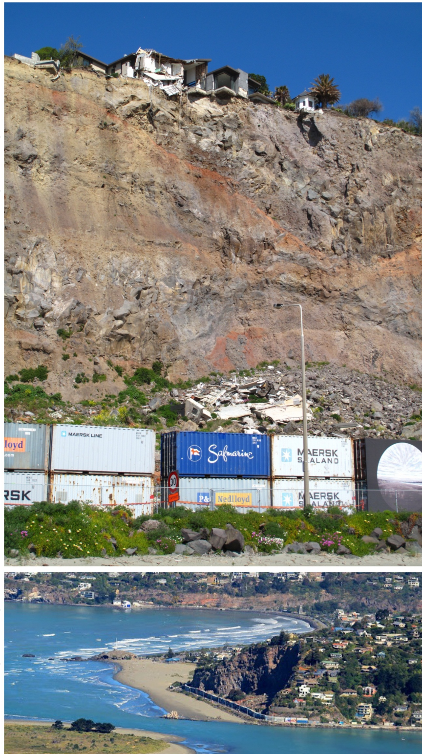
Figure 2. The collapse of Christchurch's Port Hills in the 2010/11, where fallen cliff faces have not only led to loss of property, but have also threatened access and recreation opportunities. There is now tension between community and government on the rebuilding of the road, pathways and other open space facilities.