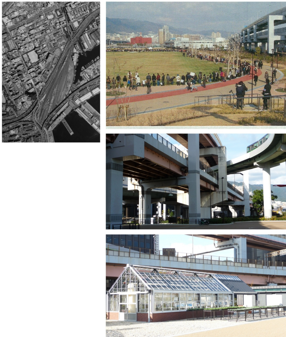
Figure 6. Minato No Mori framed by motorways, built on former railway land by the community.

in park planning: spatial diversity in elements that drive different programs and also temporal diversity that recognises that the park can fulfil functions at different times.