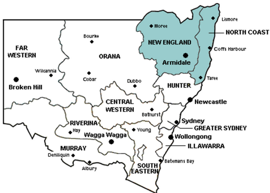
Figure 1. Tilbuster Commons was established close to Armidale, New South Wales, Australia.