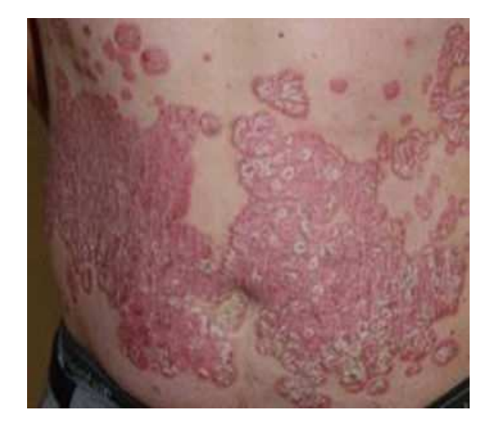
Figure 1. Typical plaque of Psoriasis Vulgaris.

As a consequence, chronic plaque psoriasis is the form of the disease entered into clinical trials and the object of the majority of investigations of genetics and pathogenesis of psoriasis. It is characterized by red, scaly, discoid lesions varying in size from 0.5 cm in diameter to large confluent areas on the trunk and limbs (Figure 1). There is a sharp line of demarcation between a plaque and clinically normal, uninvolved skin. Longitudinal studies of individual plaques have demonstrated that plaques are dynamic [10] with an active and expanding edge, sometimes to the extent that the advancing edge may become annular (Figure. 2) leaving clinically normal skin in the centre of the original plaque. The variety of plaque is characterized by welldemarcated plaques with a loosely adherent silvery-white scale, which preferentially affect the elbows, knees, lumbosacral area, intergluteal cleft, and scalp. Occasionally, pustular lesions may appear in the plaque (so-called psoriasis with pustules). Chronic plaque psoriasis is the most common variety of psoriasis, representing about 70% to 80% of psoriatic patients [11].