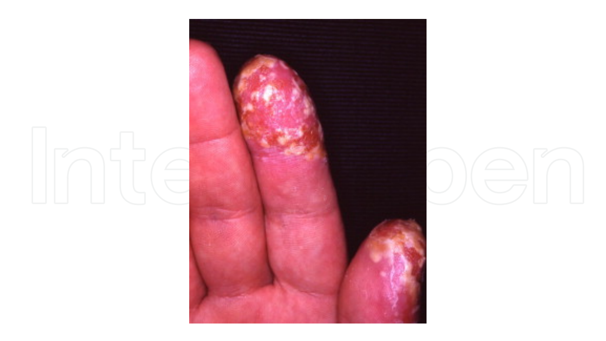
Figure 9. Acrodermatitis continua showing crops of pustular lesions at the tips of the fingers.