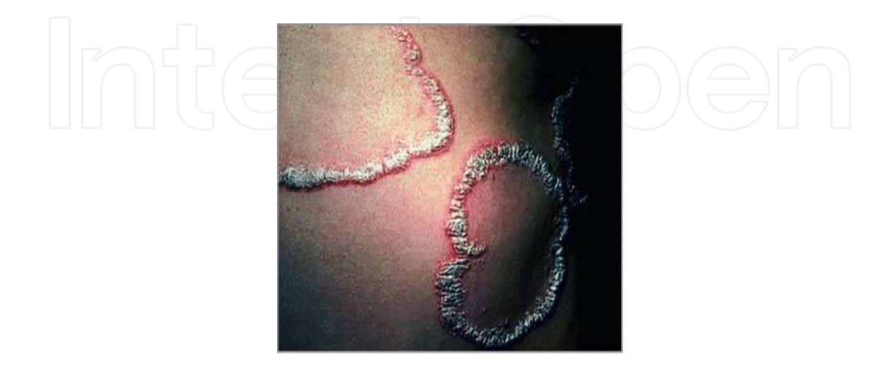
Figure 2. Annular psoriasis showing clearance in centre of plaque.