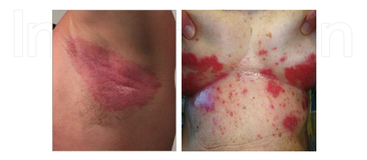
Figure 3. Flexural psoriasis, notes the relative lack of scale.