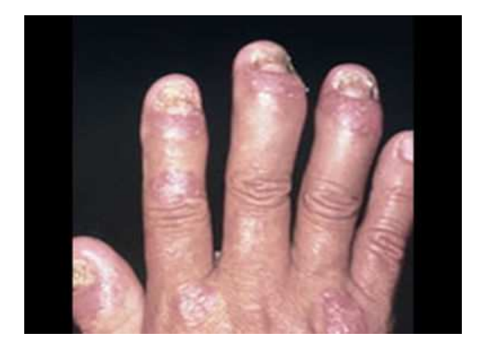
Figure 13. Psoriatic arthritis hand changes over time.

Psoriatic arthritis (PsA) is a chronic inflammatory joint disease occurring in 6–39 % of patients with psoriasis with a prevalence of PsA in the general population of about 0.1–0.25 % [29] [30]. Based on the several common clinical and radiological features, PsA is considered as a member of the family of spondyloarthritides [31]. This type of arthritis can be slow to develop and mild or it can develop rapidly. PsA can be a severe form of arthritis with prognosis similar to that of rheumatoid arthritis (RA) [32]. Psoriatic arthritis (PsA) is characterized by focal bone erosions mediated by osteoclasts at the bone–pannus junction. Importantly, 80% of patients with psoriatic arthritis have nail psoriasis (Figure13) [33]. Recognition of bone as an active organ that interacts with its environment is a relatively new development. In the pathogenesis of bone destruction associated with rheumatoid arthritis, the synovium is a site of active interplay between immune and bone cells. The interaction between T cells and osteoclasts is a critical issue in the field of osteoimmunology [34]. Further differentiate mechanisms of bone resorption and repair in PsA and RA and likely will uncover additional therapeutic targets [35].