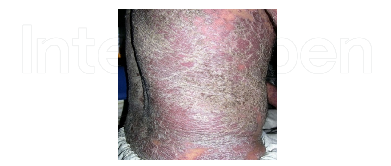
Figure 11. Erythrodermic psoriasis.

body's chemical balance and can cause severe illness (Figure11). This particularly inflammatory form of psoriasis can be the first sign of the disease, but often develops in patients with a history of plaque psoriasis.