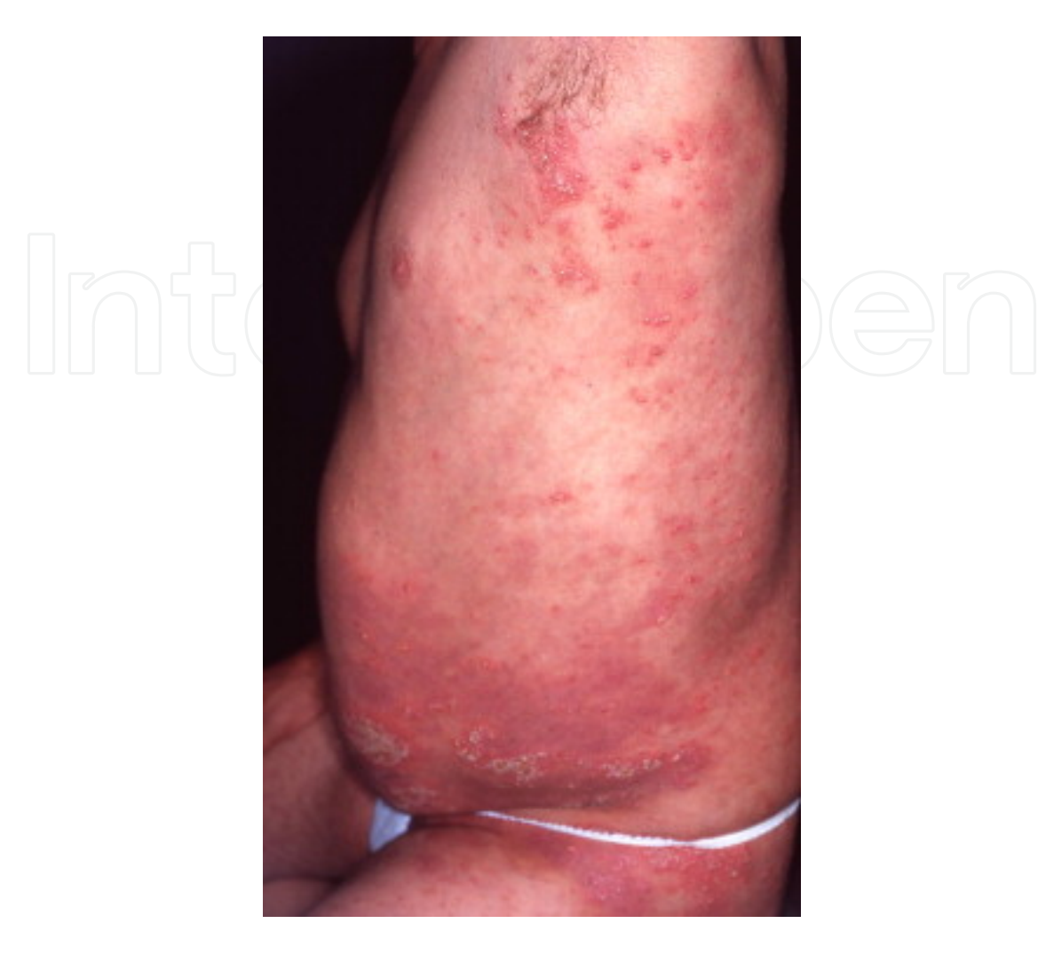
Figure 8. Early phase of generalized pustular psoriasis with edematous plaques and pustules.

Localized pustular psoriasis : Besides so-called psoriasis with pustules (sometimes referred to by the misleading term "localized form of generalized pustular psoriasis"), 2 main clinical varieties are reported as localized pustular psoriasis: acrodermatitis continua of Hallopeau and palmoplantar pustulosis.