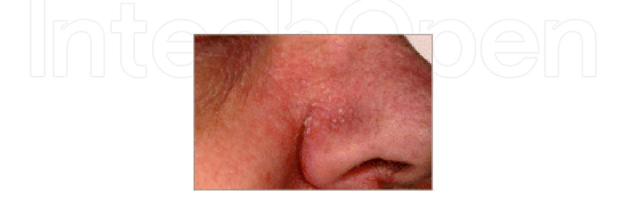
Figure 4. Seborrhoeic psoriasis, nasolabial, 'greasy' appearance and finely scaled.

Seborrhoeic : Seborrhoeic psoriasis ('sebopsoriasis'), so called because of its similarity in morphology and anatomical distribution to seborrhoeic dermatitis, may occur either in isolation or associated with plaque psoriasis elsewhere. Sites of involvement are the nasolabial folds (Figure 4), medial cheeks, nose, ears, eyebrows, hair line, scalp, presternal and interscapular regions. Characteristically the lesions are thin, red and well-demarcated (somewhat like intertriginous psoriasis) with variable degrees of scaling.