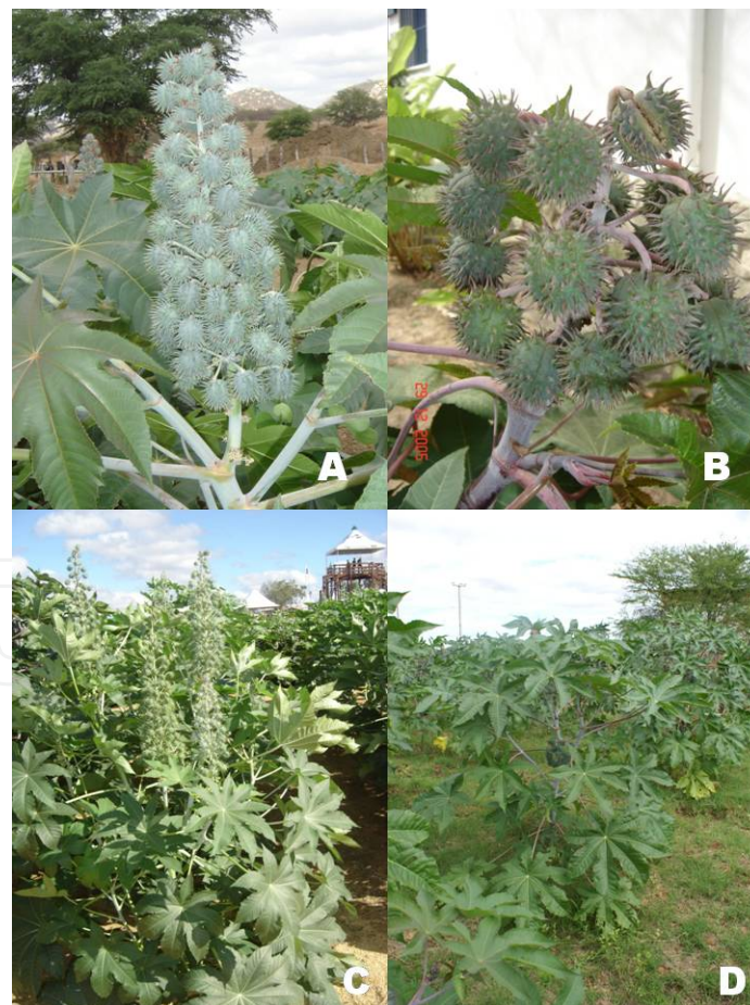
Figure 6. Embrapa´s castor cultivars: (A) BRS Nordestina, (B) BRS Paraguaçu, (C) BRS Energia, and (D) BRS Gabriela.

BRS Nordestina stands out from the average height of 1.90 m, greenish stems with the presence of wax, conical racemes, semi-dehiscent fruits, and black seeds. The period between emergence and first flowering raceme is 50 days, on average, while the average weight of 100 seeds is 68 g, and the oil seed content is 48%. The average yield is 1,500 kg/ha under conditions of normal rainfall in the Northeast semiarid region. The period between the emergence until the last harvest is 250 days. The BRS Paraguaçu has an average height of 1.60 m, purple wax stem, oval raceme, semi-dehiscent fruits and black seeds. The period from emergence to flowering is 54 days, while the average weight of 100 seeds is 71g, and the oil seed content is 47%. The average productivity is 1,500 kg/ha under rainfed conditions of the semiarid region of the Northeast. Earliness is a key feature of BRS Energia, whose average cycle is 120 days between emergence and maturation of the last racemes. The appearance of the first raceme occurs about 30 days after germination. The yield of this cultivar is 1.800kg/ha under the same climatic conditions of the others. The average plant height is 1.40 m, 100 seed weight is around 40 g