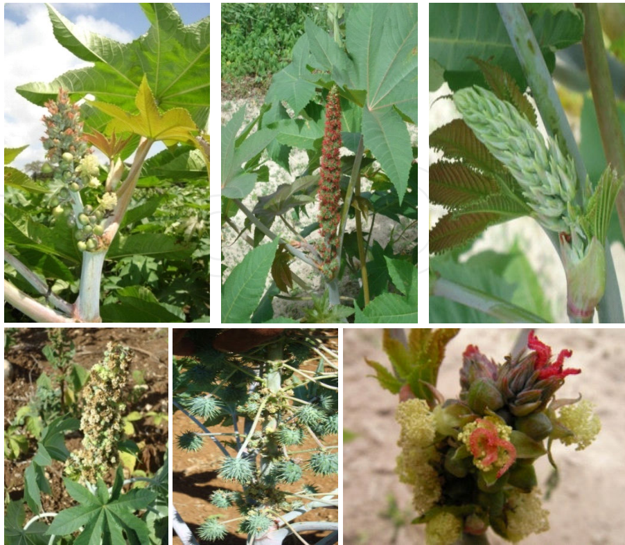
Figure 4. Arrangement of male and female flowers in racemes of castor: a) monoic normal; b and c) gynodioic; d) androdioic; e) interspersed; f) monoic bearing some perfect flowers.

among racemes can vary widely both within and among genotypes. It can also be influenced considerably by environment [27]