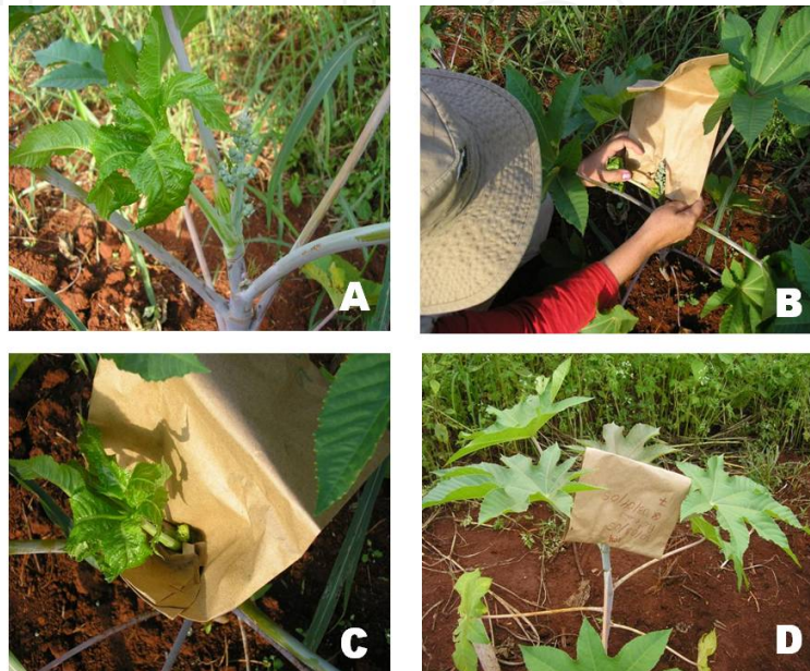
Figure 5. Self fertilization in castor. A) raceme with growing flowers; B) paper bag being placed over the raceme; C) Fixing paper bag; D) Identification.

it is necessary to isolate the area, physically (1000 meters) or temporally, or the use of self-fertilization using paper bags (Fig. 4). Both strategies are expensive. The self-fertilization is a hand labor and normally demands many people and time. is practically impossible to keep the distance recommended in areas multiplication of lines, where they are multiplied dozens of strains simultaneously because it would require a large extension of the area.