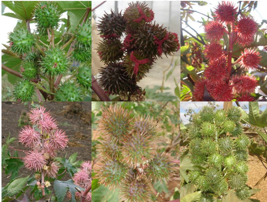
Figure 3. Examples of different colors in the fruits of castor bean.

(bloom wax), plant height (Figure 2), presence of spines on capsules (Figure 3), branching pattern, leaf shape, sex expression (Figure 4), seed color, and response to environmental conditions. Wide variation was observed in several morphological traits in the germplasm collections in India, USSR and elsewhere [14, 20, 15]. Also for quantitative traits its genetic polymorphism is exploitable in breeding programs [21, 22, 23, 24].