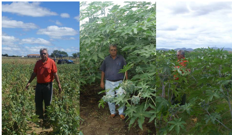
Figure 2. Examples of castor bean plants with different height.

A great variation in phenotypic expression is observed due to its cross-pollinated nature. Example of high variability in morphological characters are stem color, epicuticular wax