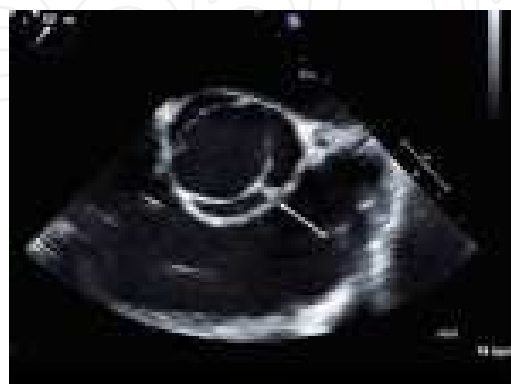
Figure 1. Transesophageal short-axis view of a BAV. There is fusion of the right and left cusps. The arrow points to the raphe.

The bicuspid valve is composed of two leaflets, of which one is usually larger (due to fusion of two cusps leading to one larger cusp), and unequal cusp size the presence of a central raphe (usually in the center of the larger of the two cusps). The raphe or fibrous ridge is the site of congenital fusion of the two components of the conjoined cusps and does not contain valve tissue (Figure 1) Three morphologies are identified: type 1, fusion of right coronary cusp and left coronary cusp; type 2, fusion of right coronary cusp and noncoronary cusp; and type 3, fusion of left coronary cusp and noncoronary cusp. The most common is type 1 (70% to 85%), followed by type 2 (10% to 30%) and most rare type 3 (1% ) [13,19,26] (Figure 2).