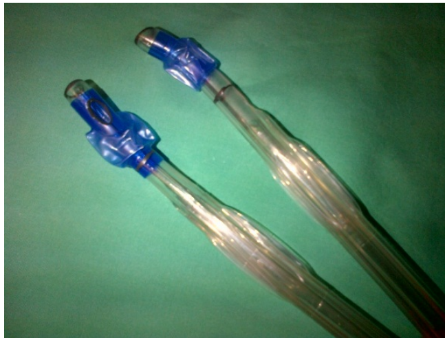
Figure 1. Left (top) and right (bottom) conformations of double lumen tubes. Note the right upper lobe ventilation lumen on the right conformation tube.

bronchus and bronchus intermedius; this secondary carina may be mistaken for the primary carina when viewed under bronchoscopy. Therefore, knowledge of distal bronchial anatomy is fundamental in confirming correct placement as well as in correcting misplacement.