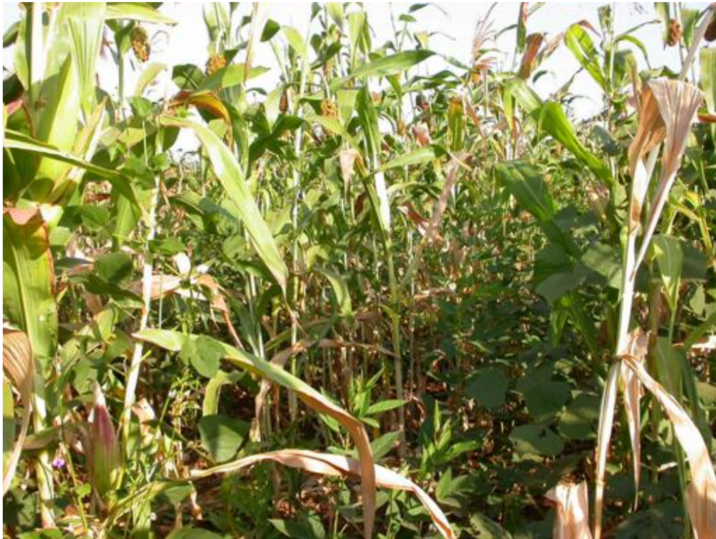
Figure 1. A mixed cropping system consisting of pigeonpea (foreground), corn, sorghum and cowpea.

field conditions. The specific objectives were to evaluate the germplasm for (i) sensitivity to photoperiod (ii) reaction to fusarium wilt (iii) reaction to insect pests and (iv) grain quality traits that are preferred by end-users.