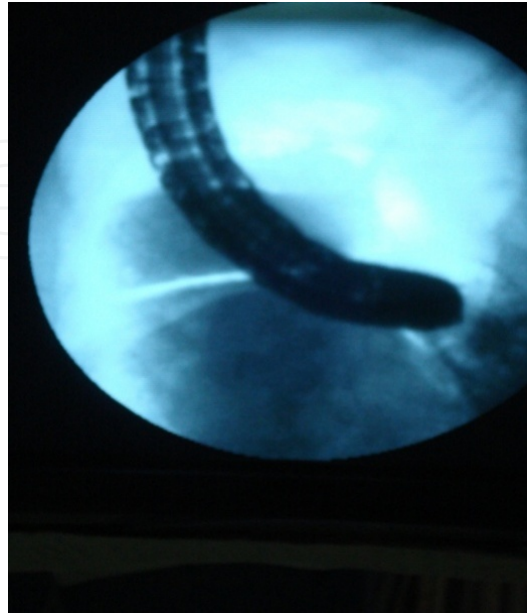
Figure 2. 12 o'clock position

the patients were given hyoscine-n-butyl bromide. The colonoscopes used were Olympus CF Q145L models.