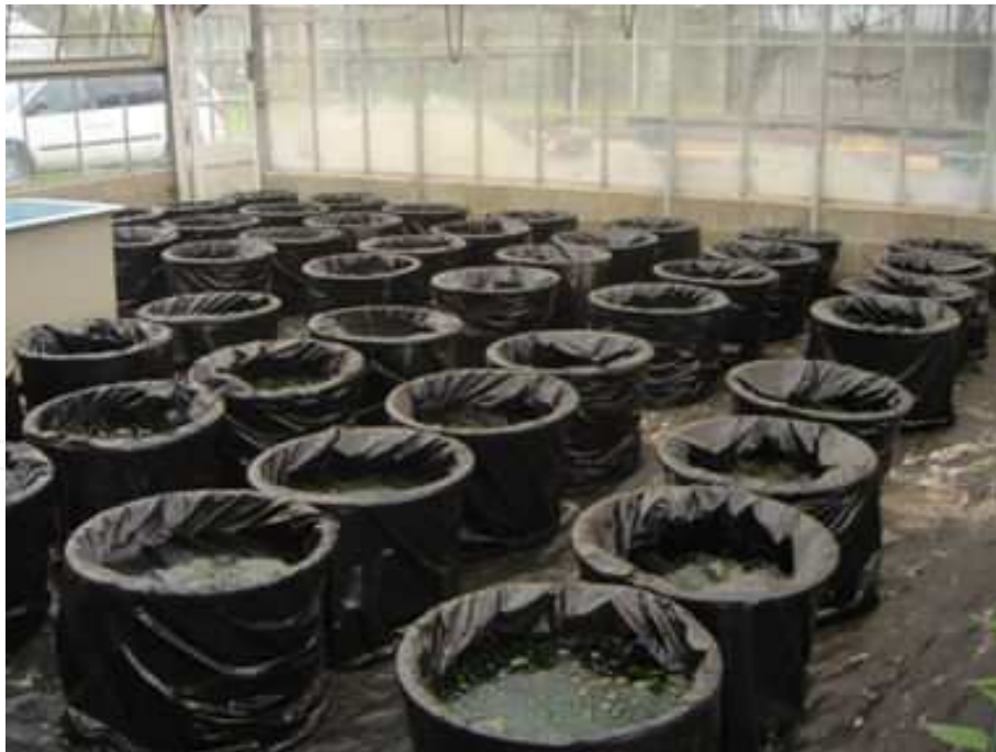
Figure 15. Efficacy testing in the greenhouse.

It is important to note that all herbicides labeled for aquatic weed control by the USEPA in the US are “general use” pesticides that can be purchased and applied by anyone, including homeowners and unlicensed applicators. However, the USEPA allows states to apply addi-