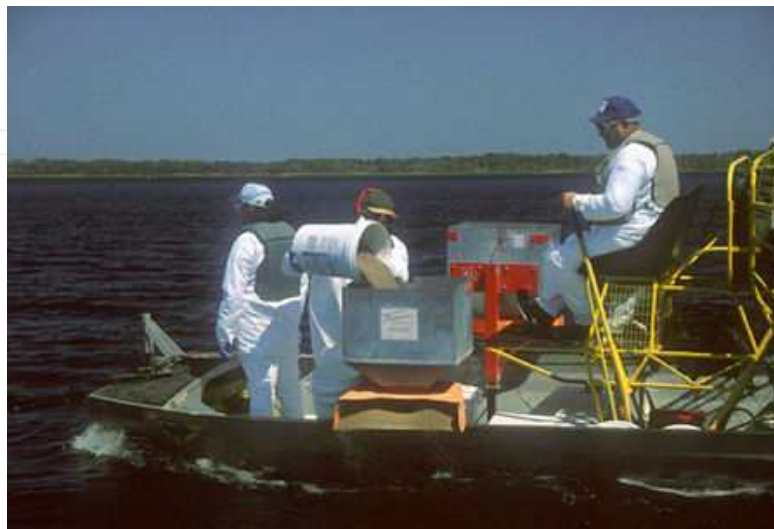
Figure 17. Application of granular herbicide using a boat-mounted spreader.