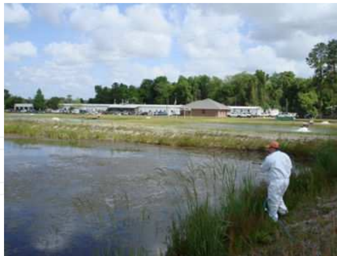
Figure 13. Herbicide applicator wearing personal protective equipment.