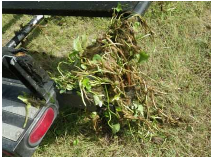
Figure 7. Aquatic weeds on a boat trailer.