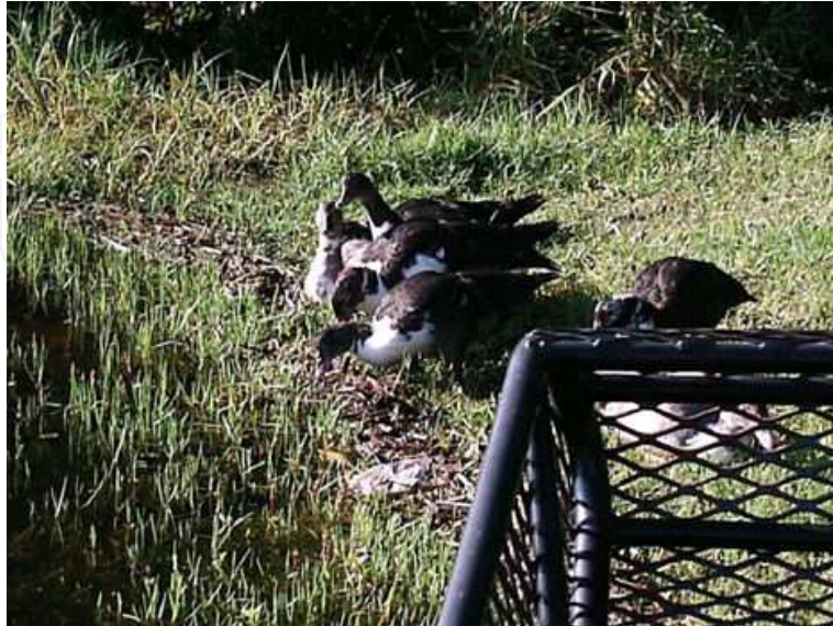
Figure 12. Ducks consuming seeds and vegetation on a pond bank.

submersed weeds necessitates weed control efforts that focus on eliminating as much vegetation as possible.