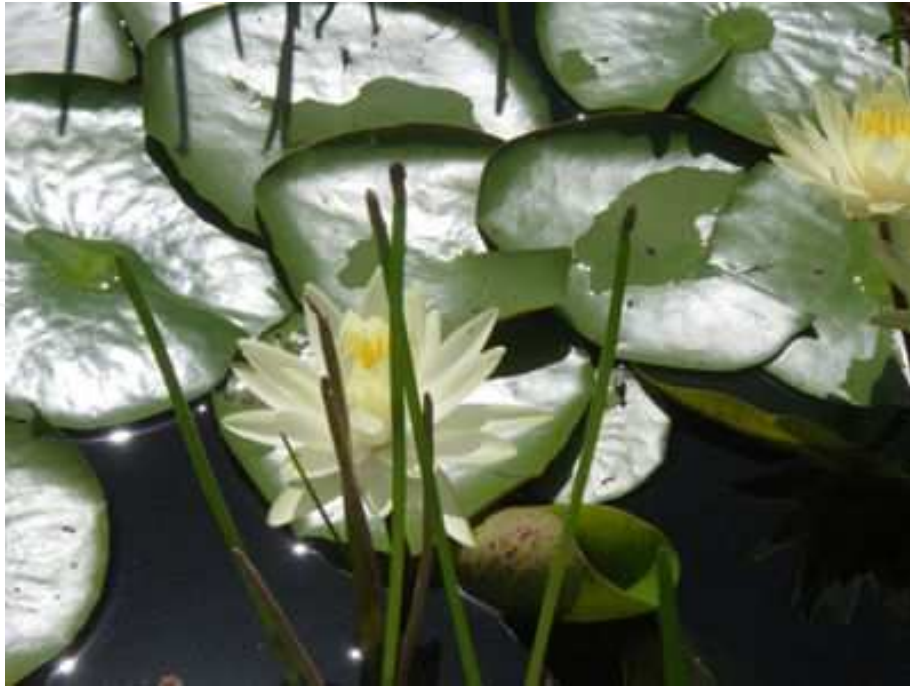
Figure 14. Waterlilies in a development pond.

market for aquatic weed control products is much smaller; for example, public agencies in Florida spent around $22.5 million in 2005 to manage aquatic invaders in public waters [42]. Any product that is marketed in the US to control pests – including weeds – must first be labeled by the US Environmental Protection Agency (USEPA or the Agency). Obtaining a pesticide label from the USEPA is a time-consuming and expensive undertaking; the Agency requires registrants (the manufacturer or group seeking a pesticide label) to submit data from more than 100 tests before a product can be evaluated for possible labeling, and the testing process typically requires the investment of tens of millions of dollars [43]. These tests are conducted to determine the effects of the experimental pesticide on the organism targeted for control, but also to assess its impact on non-target organisms, human health, and the environment as well. USEPA regulation of pesticides began with the adoption of the Federal Insecticide, Fungicide, and Rodenticide Act (FIFRA) in 1947; FIFRA has since been amended multiple times, most notably by the Federal Environmental Pesticide Control Act of 1972, and continues to serve as the primary process to ensure that human health and the environment are not negatively impacted by the use of pesticides [43].