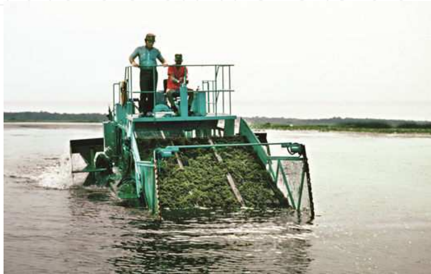
Figure 8. Mechanical harvesting of hydrilla.

similar in appearance to desirable native plants that should be allowed to remain in the system. In contrast, mechanical harvesters are “non-selective” – they indiscriminately remove all plant material in the harvesting zone and are unable to distinguish between weeds and native species. Also, mechanical harvesters often result in bycatch, or the removal of fish and other aquatic fauna along with plant material. This problem is most pronounced when shallow-water (upper 5 feet; 1.5 m) harvesters are employed and can result in the removal of up to 28,000 fish per acre [23], but bycatch can be reduced by greater than 99% (removal of around 120 fish per acre) when deep-water (upper 10 feet; 3 m) harvesting is utilized [24].