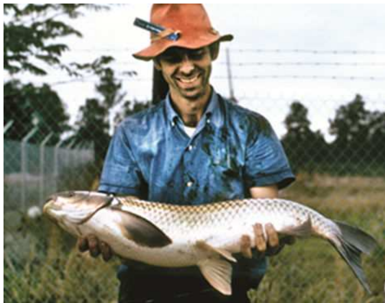
Figure 9. Asian grass carp.

vegetation in an aquatic system. Also, because the grass carp is a non-native introduced species, special precautions must be taken to reduce the likelihood of these biocontrol agents becoming invasive themselves. In Florida and many other states in the US, a permit must be issued by state resource managers before the introduction of grass carp into an aquatic system (although some states prohibit the use of grass carp as biocontrol agents altogether) [28]. In most cases, permit holders must ensure that stocked waters are secured (i.e., water intakes and outflows must be screened) to prevent the fish from escaping into other waters and all released grass carp must be triploid. Triploidy is the presence of an additional set of chromosomes, a condition that is induced by subjecting fish eggs to cold, heat, or pressure shock treatments immediately after artificial fertilization, and renders the grass carp unable to reproduce [29].