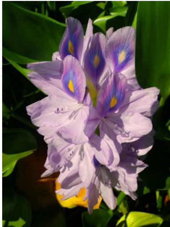
Figure 1. Waterhyacinth.

others by tossing his extra plants into the St. Johns River [2]. Within a decade, the St. Johns was so clogged with waterhyacinths that navigation had become impossible [1-3].