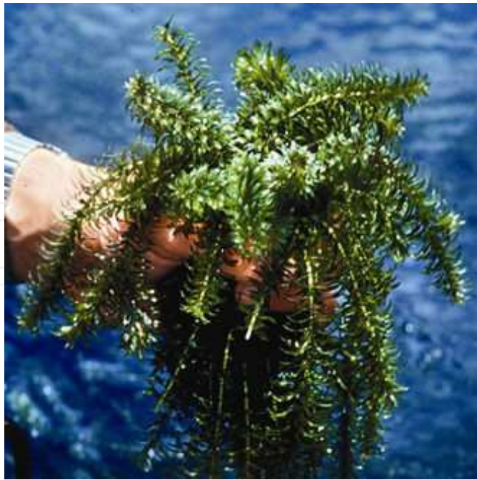
Figure 3. Hydrilla.

Chinese grass carp ( Ctenopharyngodon idella Val.) [15, 16], but the vast majority of resource managers rely on chemical control to keep the growth of hydrilla in check.