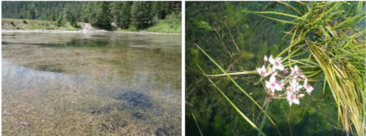
Figure 5. Other common aquatic invaders in the US. Left: curlyleaf pondweed. Right: flowering rush (emerged) and Eurasian watermilfoil (submersed).

Waterhyacinth and hydrilla quickly establish and become invasive in virtually all areas where they have been introduced, but these species are not the only aquatic plants that cause problems in natural systems, reservoirs, and canals through the world. For example, resource managers charged with protecting the waters of the Pacific Northwest and many other parts of the US struggle with invasions of Eurasian watermilfoil ( Myriophyllum spicatum L.), flowering rush ( Butomus umbellatus L.), and curlyleaf pondweed ( Potamogeton crispus L.) (Fig. 5). It is thought that these species were initially introduced through the aquarium and nursery trade, but have since spread throughout the country's waters as a result of improper or inadequate cleaning of contaminated equipment that has been moved from infested sites to pristine waters.