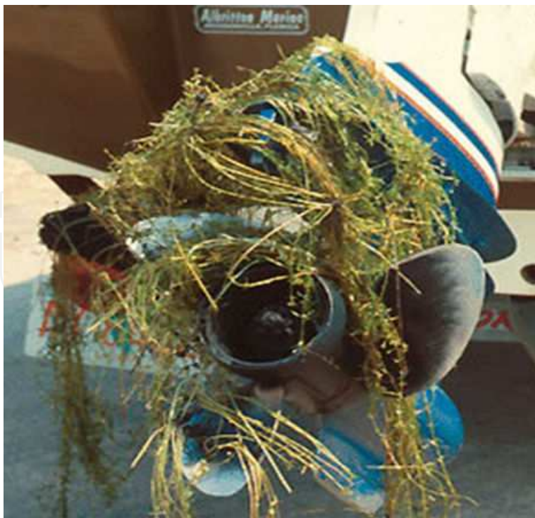
Figure 4. Boat motor clogged with hydrilla.

Chinese grass carp ( Ctenopharyngodon idella Val.) [15, 16], but the vast majority of resource managers rely on chemical control to keep the growth of hydrilla in check.