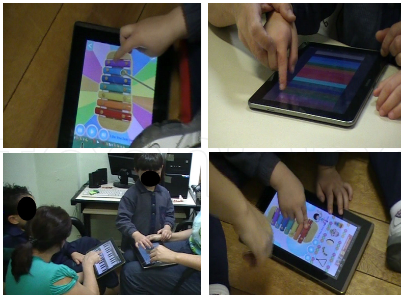
Figure 4. Using different tablet applications