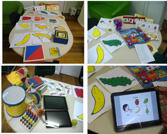
Figure 3. Example of AC material of low and high technology