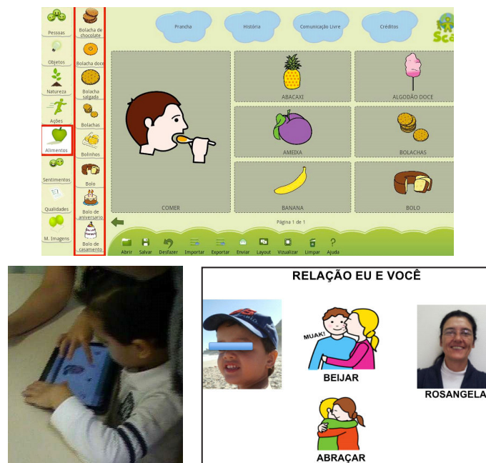
Figure 6. the use of SCALA with subjects with autism in the tablet and a board with symbols

Subject 3, through mediating actions accepts touch and demonstrates affection through kisses and hugs. Aggression is only expressed when he feels some pain. His interactions with the object increase and he starts participating in some mediating actions with the researcher. Only one word was said after great insistence, but the symbols of alternative communication start being understood, which is likely to contribute to his way of communication soon.