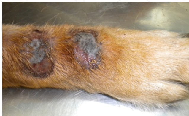
Figure 6. Acral lick dermatitis. Ulcerated plaques with tissue necrosis in the distal portion of a dog's forelimb.

Diagnosis requires complete clinical evaluation (anamnesis, physical, neurological and dermatological exams), complete blood cell count, serum biochemical profile and urinalysis. Only after the elimination of possible organic causes for acral lick dermatitis, it can be considered a behavioral disorder. In this case, the animal behavior should be evaluated, with the observation of its environmental and social stimuli and their motivational status. Treating acral lick dermatitis is notoriously challenging. The animal's environment should be modified to eliminate or minimize their exposure to stress factors [142], and the use of anti-depressives as fluoxetine 20 mg/day may help significantly in compulsion control which improves the lesions [143].