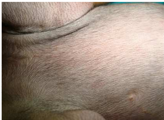
Figure 5. Canine pattern baldness. A Doberman pinscher with alopecia of the chest, which is characteristic of pattern alopecia (Veterinary Hospital of the Federal University of Viçosa).