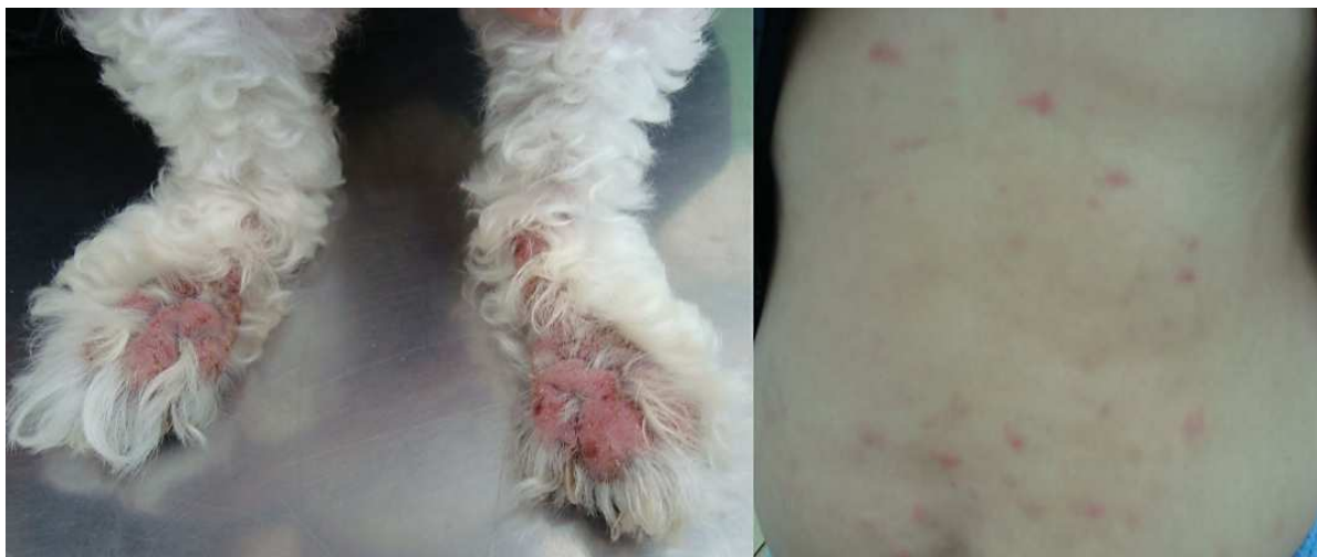
Figure 4. Scabies. Figure on the left: a dog with erythematous, alopecic and lichenified pruritic lesions in the distal aspect of the hind limbs. Figure on the right: the animal's owner presenting abdominal pruritic papular lesions, highlighting the zoonotic aspect of scabies.

NOTE: The permission for the use of macrocyclic lactones in the treatment of cats and dogs is different for each country. The rules concerning its use should be checked before treatment institution and the owners must be warned in order to authorize any extra-label use of these medications.