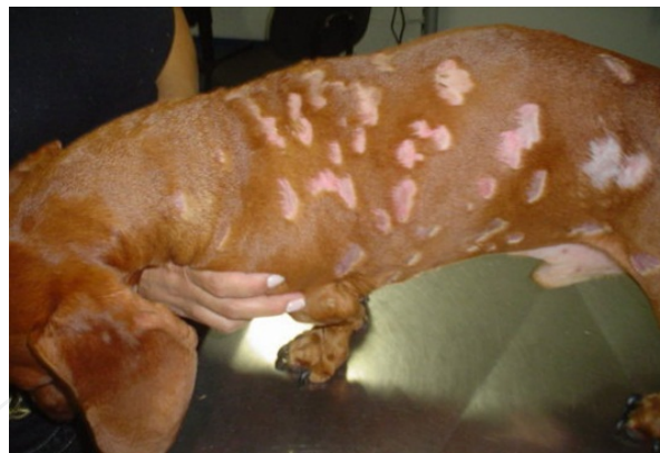
Figure 2. Superficial bacterial folliculitis in a Dachshund. Multiple areas of alopecia and erythema are seen in the trunk area.

The treatment varies depending on presented lesions. Local surface and superficial pyodermas may be treated only with topical antibiotics such as silver sulphadiazine, neomycin or 2% mupirocin ointments applied twice daily over the affected areas. Generalized lesions and deep pyodermas require a combination of oral and topical antibiotics. In patients with severe pruritus it is recommended to use anti-inflammatory doses of prednisone orally for up to two weeks [17]. The antibiotics of choice for oral use include cephalexin (22-33 mg / kg q12h) and amoxicillin associated with clavulanic acid (22 mg/kg q12h) [18]. Recurrent cases require culture and susceptibility testing to access resistance [16].