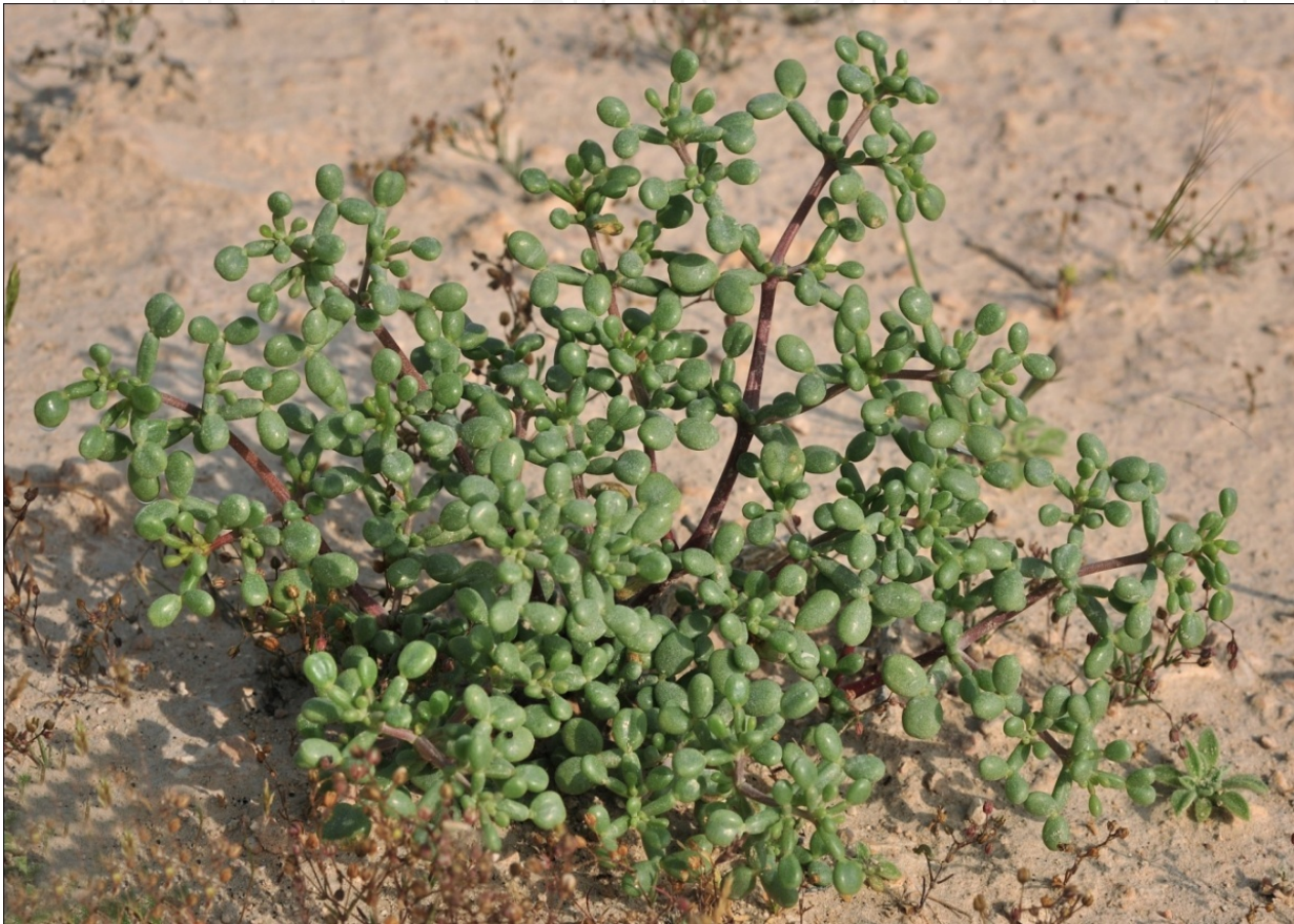
Figure 3. Branches of Tetraena qatarense with the fleshy leaves and woody stems.

in spite of its succulence characteristic and its ability to store water in different plant parts (Fig. 4). This species has been considered as a desert species suspected as halophyte. Its life form was considered as Sub-Fruticose Chamaephytes, erect fruit shoot at base [38]. It grows in various habitats, including disturbed areas and saline soils, in deserts, plains, coastline, and other places. It is a fleshy annual plant, producing several erect, ribbed stems 35 to 45 centimeters in maximum height. Although these plants are considered as xerophytes, they might have also well adapted to saline environments, since they are living in soils of high salinity levels [4].