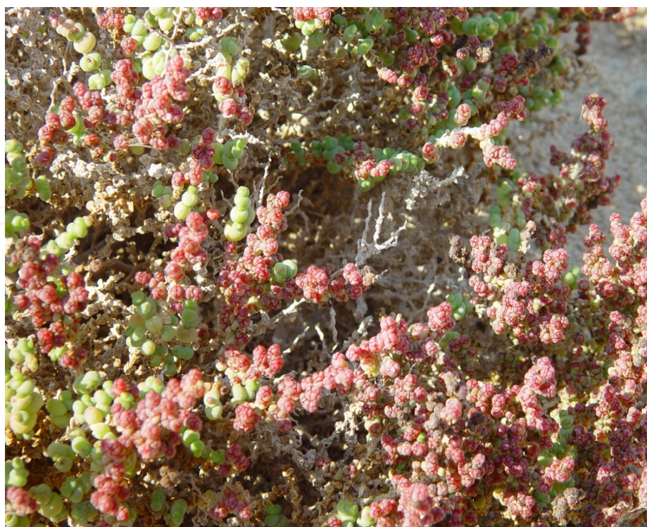
Figure 6. Halopeplis perfoliata habit.