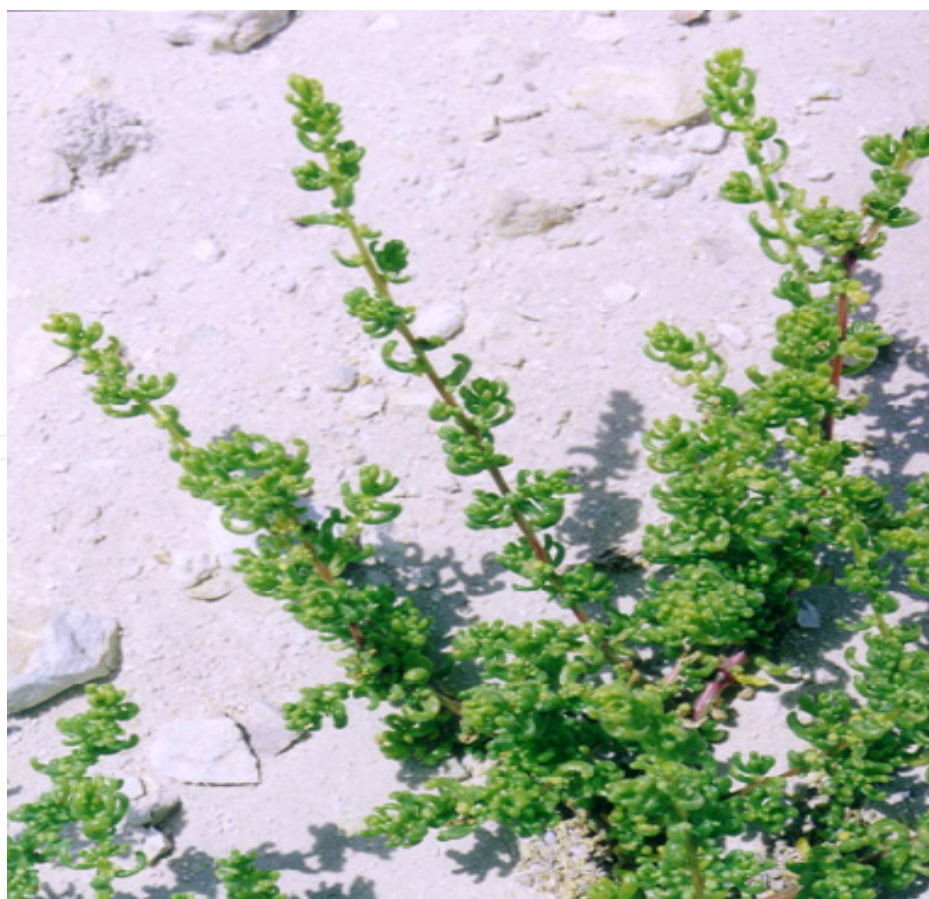
Figure 7. Suaeda aegyptiaca shoots.