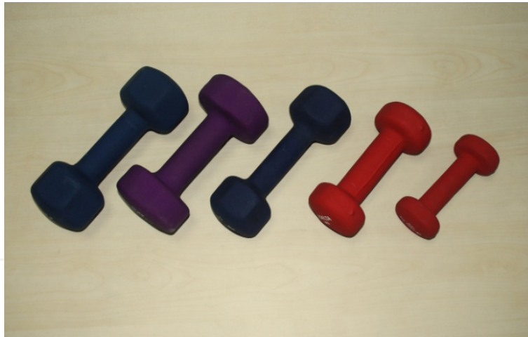
Figure 3. Dumbbells for progressive resistance exercise