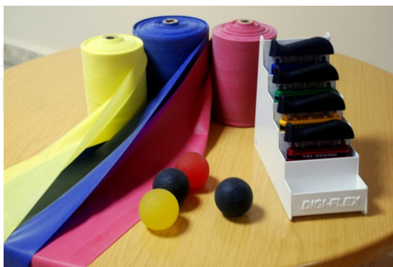
Figure 1. Exercise apparatus for hemodialysis patients

Johansen et al. [50] sought to comprehend whether hemodialysis patients differ from healthy sedentary persons. To ascertain whether or not they were as active, they researched physical activity levels and clinical status. It was determined that hemodialysis patients were less active than healthy sedentary persons. The difference between the two increased in parallel to age. It was indicated that anemia and muscular weakness were key factors in diminishing functional capacity.