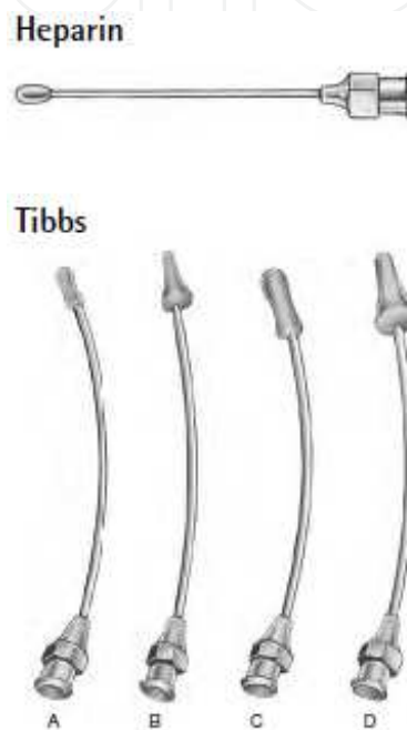
Figure 1. Special olive-headed needles for irrigation

irrigation should be discouraged because of risk of intimal injury induced by such cannulas. In many cases, it may be difficult to find the artery first because it is hidden by other hilar tissues or retracted to the deeper hilar areas of the graft. In such conditions the irrigation may be started by cannulation the more accessible renal vein, till the surgeon finds the artery. All the dissections should better be done after complete irrigation. At this point all of the renal parenchyma will appear in yellow-pink color. All of the dissections should be done delicately by using atraumatic or microvascular instruments, without any more injury to the vessels intima or their major branches and any more unusual traction of the vessel wall.