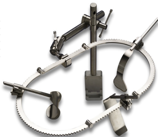
Figure 4. Bookwalter retractor