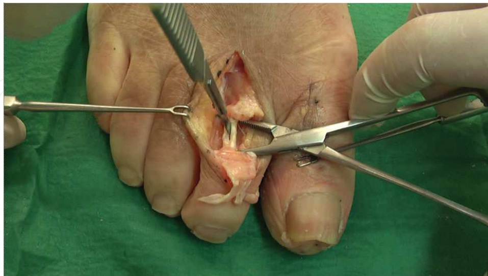
Figure 5. Flexor digitorum brevis is divided longitudinally and proximally using a blade #15 to permit passage of the flexor digitorum longus tendon.