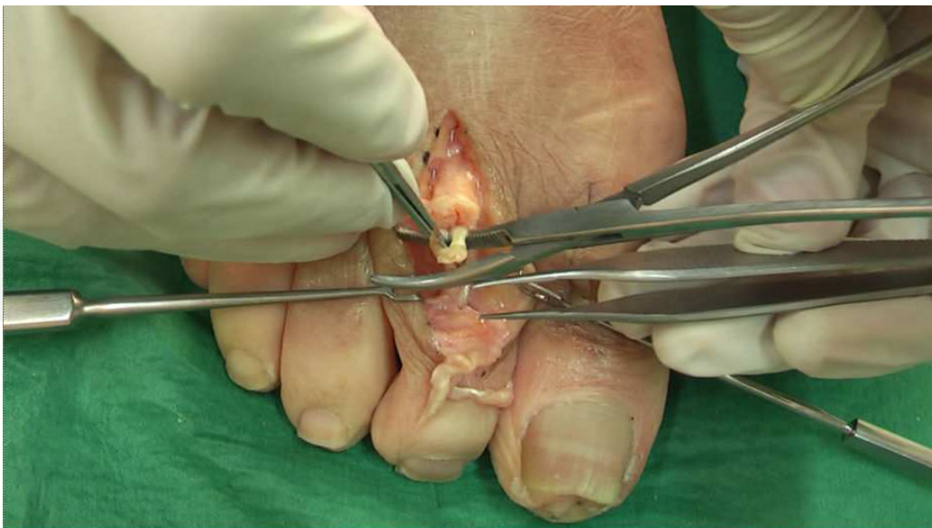
Figure 11. The long flexor is split longitudinally using a #15 blade.