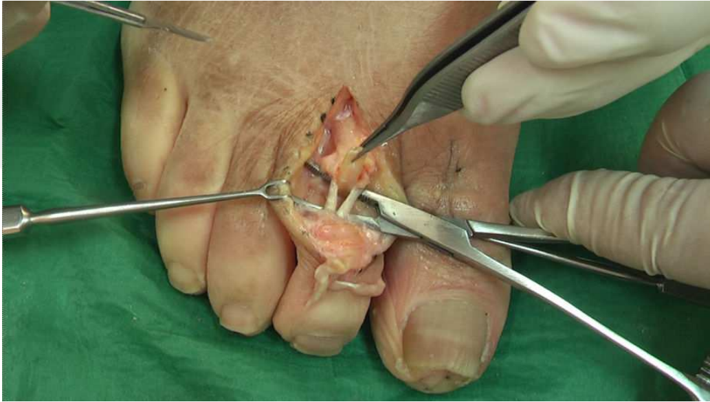
Figure 10. The stump of the proximal flexor digitorum longus tendon is clamped.