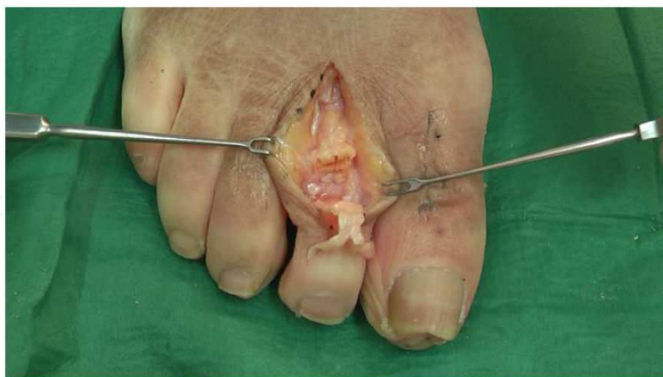
Figure 1. Dorsal aspect of the second digit after arthroplasty of the proximal phalanx and release of the metatarsophalangeal joint. The base of the middle phalanx is exposed. The proximal phalanx with the head resected is shown, and plantarly is the digital segment of the distal tendon sheath of the flexor digitorum longus and brevis tendons.