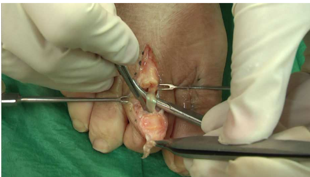
Figure 9. Flexor digitorum longus tendon is cut through its insertion point as distally as possible to the middle phalanx to maximize the length of the free distal tendinous stump.