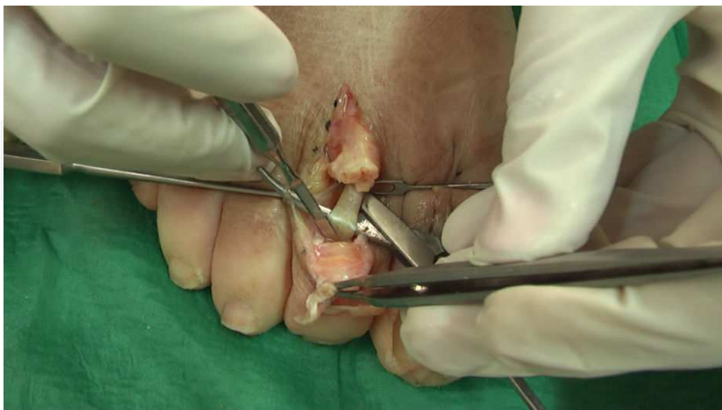
Figure 8. Using a mini-osteotome, the flexor digitorum longus tendon is released from the plantar aspect of the middle phalanx distally to obtain more tendon to facilitate the transfer.