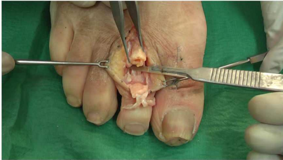
Figure 2. The plantar vincula are sectioned to release the flexor tendon sheath at the plantar aspect of the proximal phalanx of the second digit.