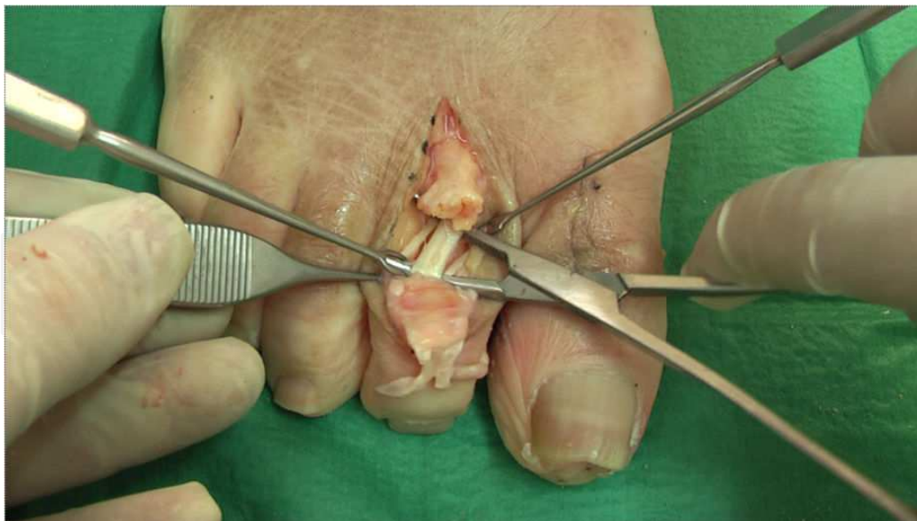
Figure 7. Using a curved hemostat and situating it plantar to the flexor digitorum longus is collocated dorsally between the medial and lateral hemitendons of flexor digitorum brevis.