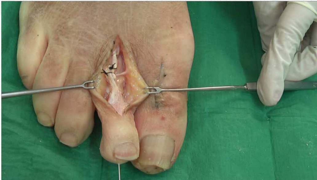
Figure 14. The extensor digitorum longus tendon stumps are sutured over the transferred flexor digitorum longus tendon.

The toe was pinned using a double-pointed 0.54-mm Kirschner wire in a retrograde manner driven antegrade from the PIP joint, out the tip of the toe, and then retrograde into the proximal phalanx and the metatarsal head. The EDL stumps were sutured over the transferred FDL tendon (Fig. 14), and cutaneous suturing was performed in a usual manner.