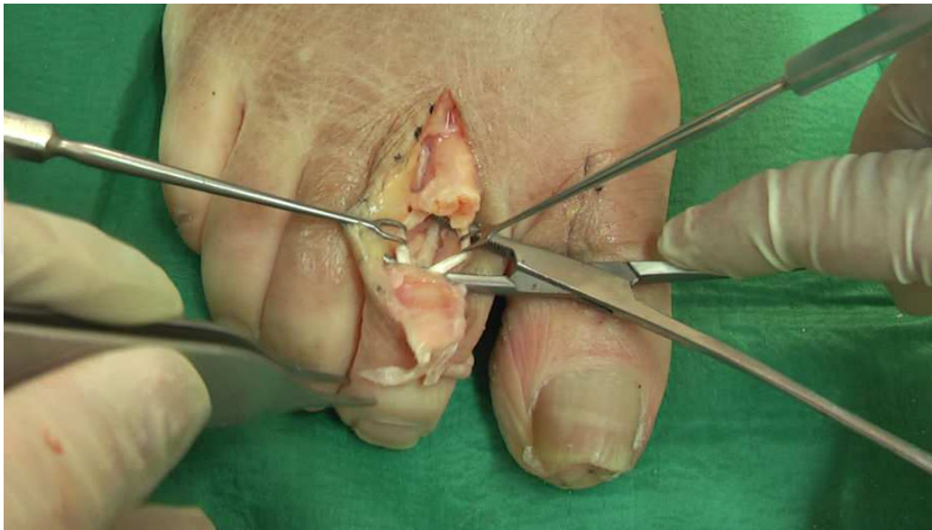
Figure 6. Medial and lateral hemitendon of the flexor digitorum brevis are retracted for plantar exposure of the flexor digitorum longus tendon.