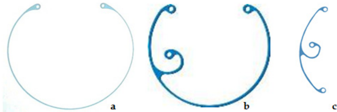
Fig. 3. a. Capsule Tension Ring, b. modified Capsule Tension Ring, c. Capsule Tension Segment.

In more advanced cases of profound zonule fragility a modified CTR, with a single or double eyelet for suture fixation to the sclera in areas of weakness, should be considered (Cionni & Osher, 1998) (Figure 3b). Capsule either iris retractors placed at the edge of capsulorhexis can be effective in holding capsulorhexis in place during phacoemulsification. They can also provide support for the capsulozonular complex (V. Lee & Bloom, 1999; Santoro et al., 2003). In advanced cases of profound zonule instability a capsule tension segment (CTS) can be useful (Figure 3c). The capsule tension segment serves as retracting apparatus and supporting stent for the capsular bag during phacoemulsification (Hasanee et al., 2006). It has an eyelet that can be used for suture fixation to the sclera in areas of weakness providing postoperative stability and good centration of the IOL/capsular bag complex. Unlike the larger CTR and modified CTR, the CTS can be positioned atraumatically and safely in the presence of an anterior or posterior capsule tear provided the CTS is not positioned within the tear itself. One or two CTR devices can be used simultaneously too.