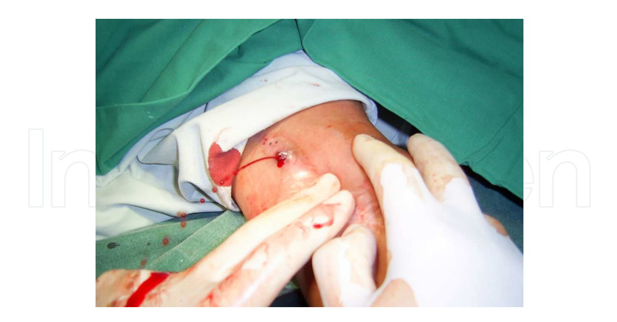
Figure 4. Bleeding from the necrotic skin area

Surgical treatment involves the bleeding point skin suture, then making a circular incision around the necrotic segment and carefully dissecting it away from the vein, without entering the vein.