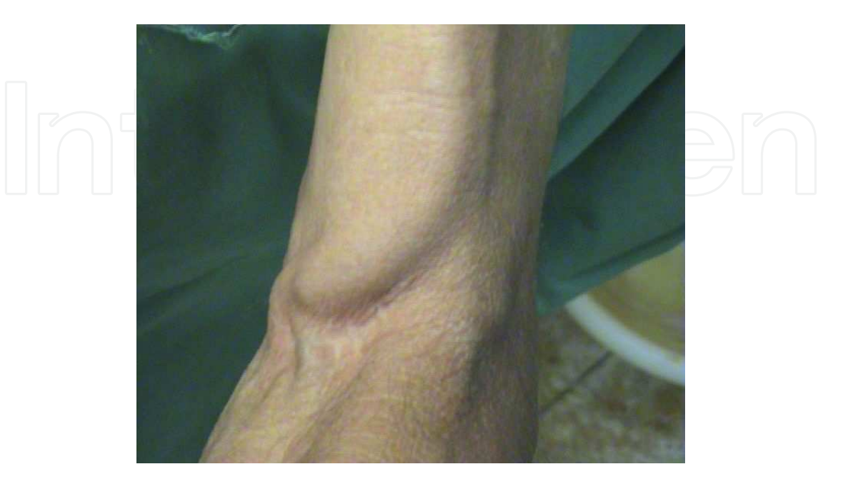
Figure 6. Accessory radial vein with a high origin in a patient with a brachio-cephalic fistula

cephalic vein. Even after arterialization of the cephalic vein, this branch maintains a small diameter and can be used to divert the blood flow from the larger cephalic vein (figure 6).