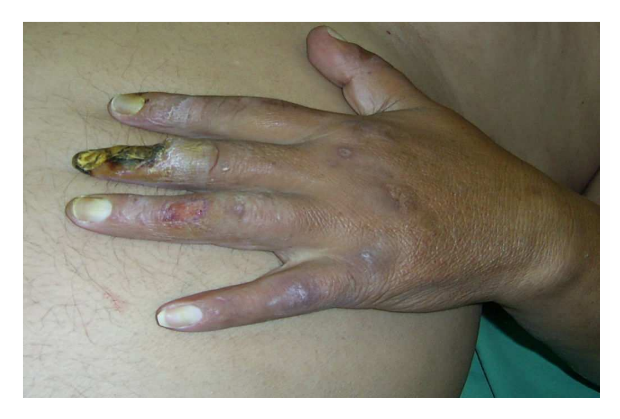
Figure 5. Ischemic hand and necrosis of the fingers in a patient with a brachio-cephalic fistula

All attempts should be made to salvage the limb firstly, and the fistula, secondly. The most direct and simple technique is outflow ligation. The vein is exposed close to the anastomosis and doubly ligated with a number 5 Nylon tape. The thrill should disappear and distal perfusion is immediately improved, with quick remission of symptoms. The major drawback is that the AVF is lost for further access.