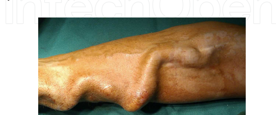
Figure 1. Aneurysm of the cephalic vein in a patient with a radio-cephalic fistula

Venous aneurysm occurs in uncorrected hypertensive patients, months or years after fistula construction, irrespective of the fact that the fistula has or has not been used for HD (figure 1). The incidence of this complication was 3.6% (30 patients) in our group and 4.2% in the group from Cameroon [1].