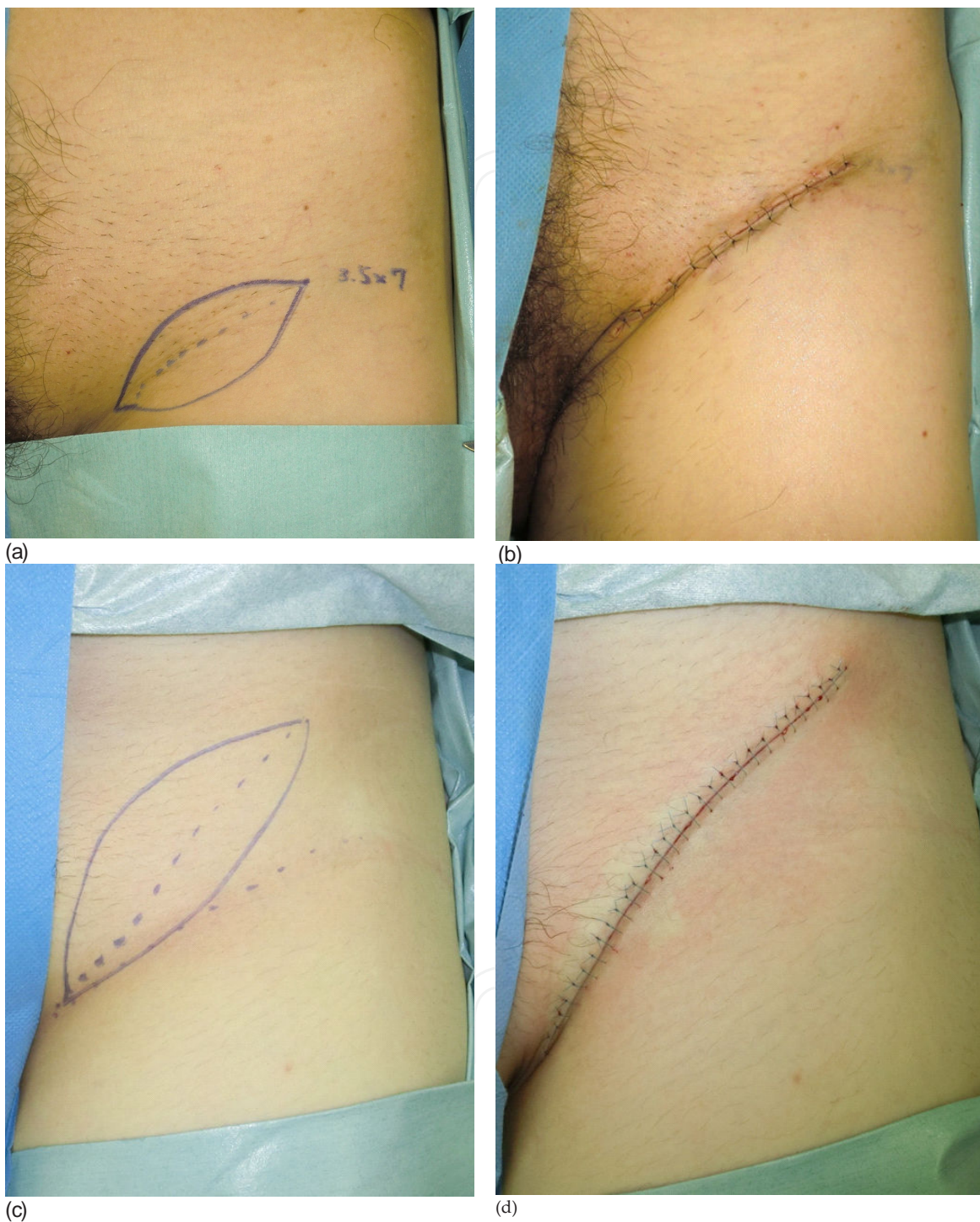
Figure 1. (a) Design of harvesting a skin graft on the conventional inguinal region (b) The sutured wound on the inguinal crease (c) Design of harvesting a skin graft on the our on the high-cut leg region (d) The sutured wound on the high-cut leg region