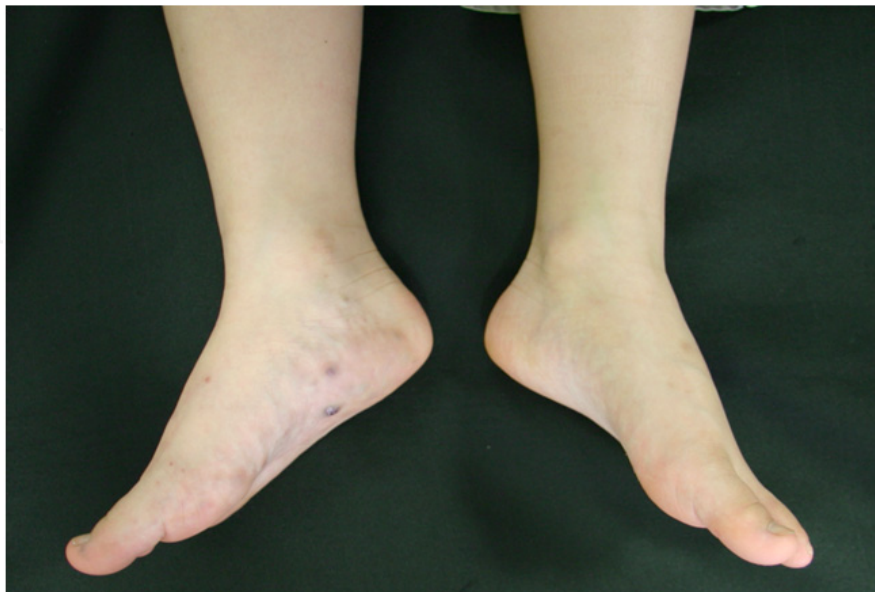
Figure 3. The differences of length and size of the legs are noted.