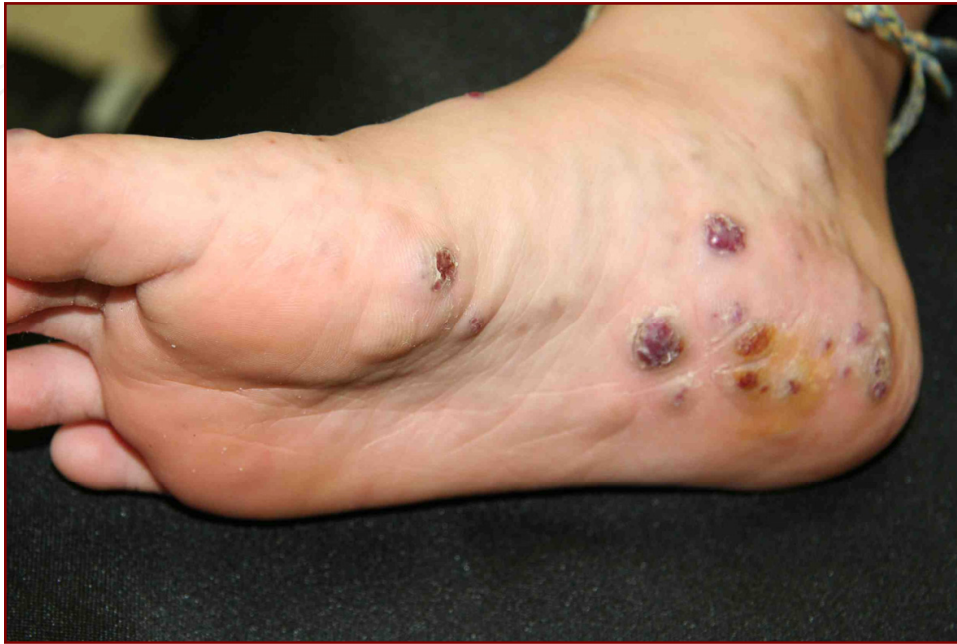
Figure 2. Multiple hemangioma on the sole