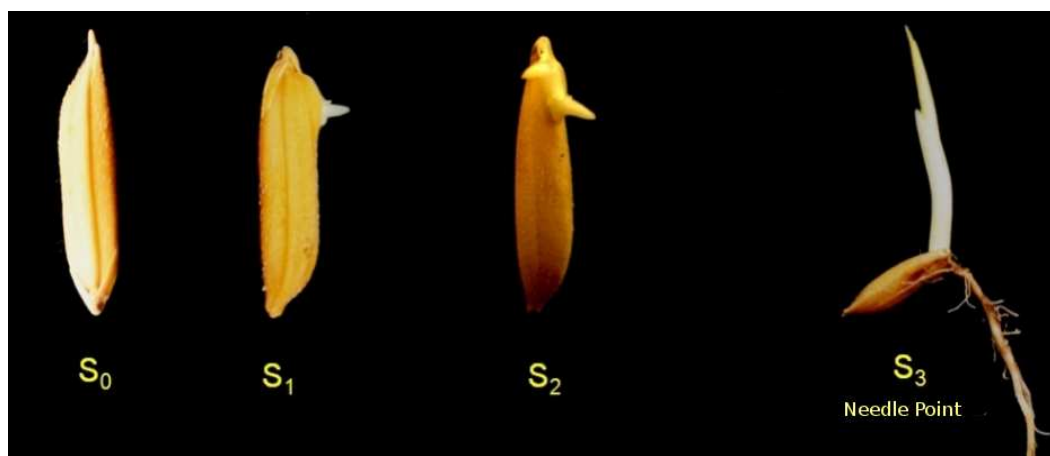
Figure 3. Rice seeds at distinct germination stages, from S0 to S3 (needle point).

Another option defined in [40] is the use of PSII inhibitors like bentazon or carfentrazone-ethyl in post-emergence. Carfentrazone, however, may cause severe damage to rice. In addition, both chemicals are contact-only herbicides, which means that a good coverage of the plants by using higher water volumes than the usual followed by flooding on the following day, should allow good results.