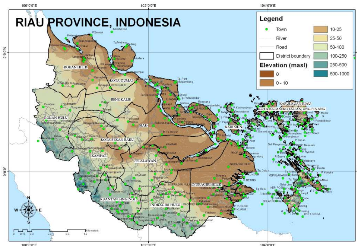
Figure 2. Topographical map of Riau.