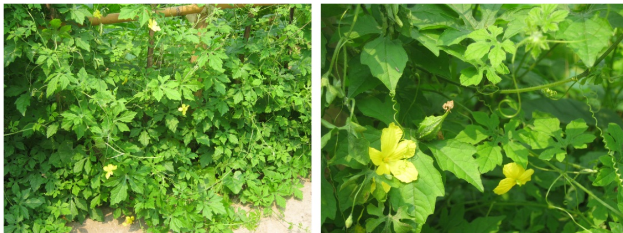
Figure 1. Flowers, immature fruit and young leaves of Momordica charantia (MC) at a home garden in Chiang Mai, Thailand (the picture was taken in March, 2012).

MC is an herbaceous, tendril-bearing vine growing up to 5 m in length. It bears simple, alternate leaves, with 3-7 deeply separated lobes. Each plant bears separate yellow male and female flowers [12]. Fruit 2.5-25 cm long, oblong, pendulous, fusiform, usually pointed or beaked, ribbed and bearing numerous triangular tubercles, 3 valves are present at the apex when mature. MC are perennial climbers cultivated throughout India and in Southern China and is now found naturalized in almost all tropical and subtropical regions. It is an important vegetable in India, Sri Lanka, Vietnam, Thailand, Malaysia, the Philippines and Southern China. It is also cultivated on a small scale in tropical America. MC is grown mainly for the production of immature fruit, although the young leaves are edible as a vegetable [3]. The young fruit is emerald green, but turns to orange-yellow when ripe. At maturity, the fruit splits into irregular valves that curl backwards and release numerous brown or white seeds encased in scarlet arils (Figure 1). All parts of the plant, including the fruit, taste bitter. It has been used extensively in traditional medicine as a remedy for diabetes.