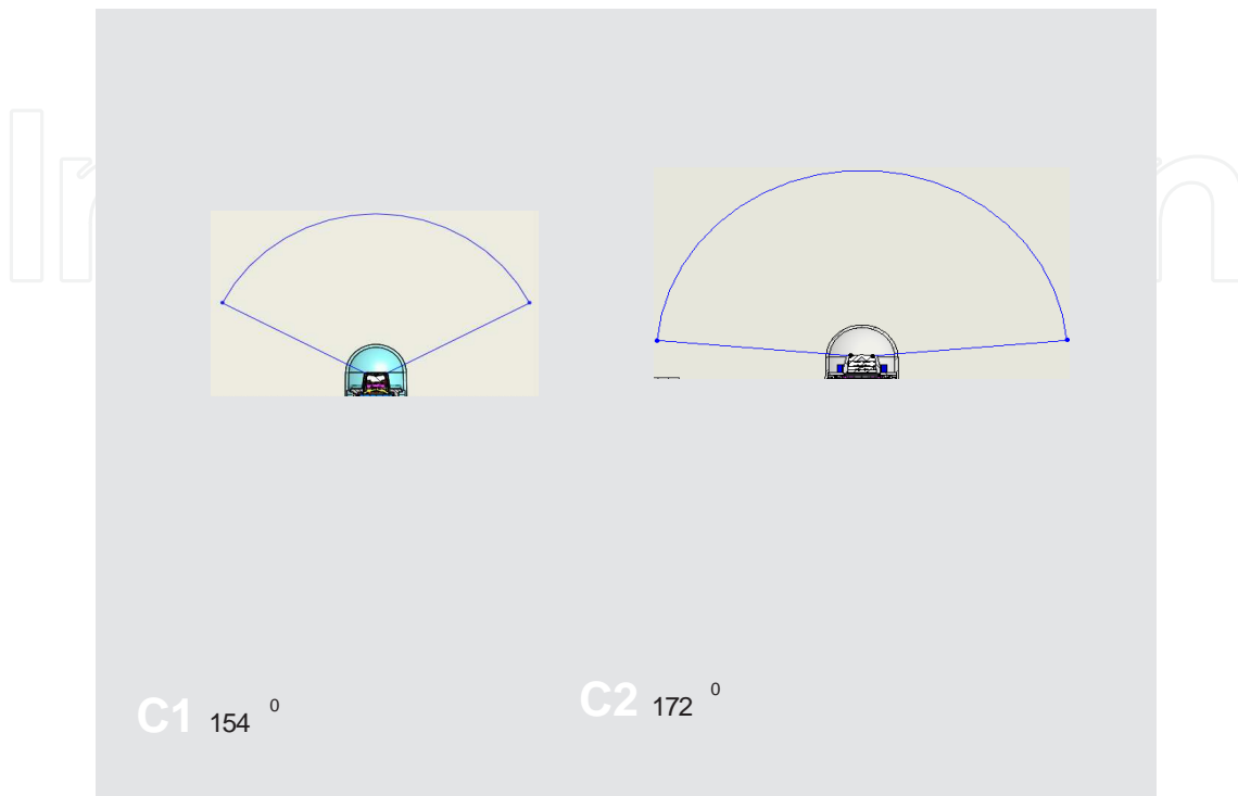
Figure 2. The left side image demonstrates the angle of view of the out dated C1 colon capsule. The right hand image demonstrates the angle of view of the C2 colon capsule with a near panoramic view.

The angle of view of this new colon capsule camera was extended from 154 to 172 degrees for each camera. This change provides a near full panorama view (see Figure 2).