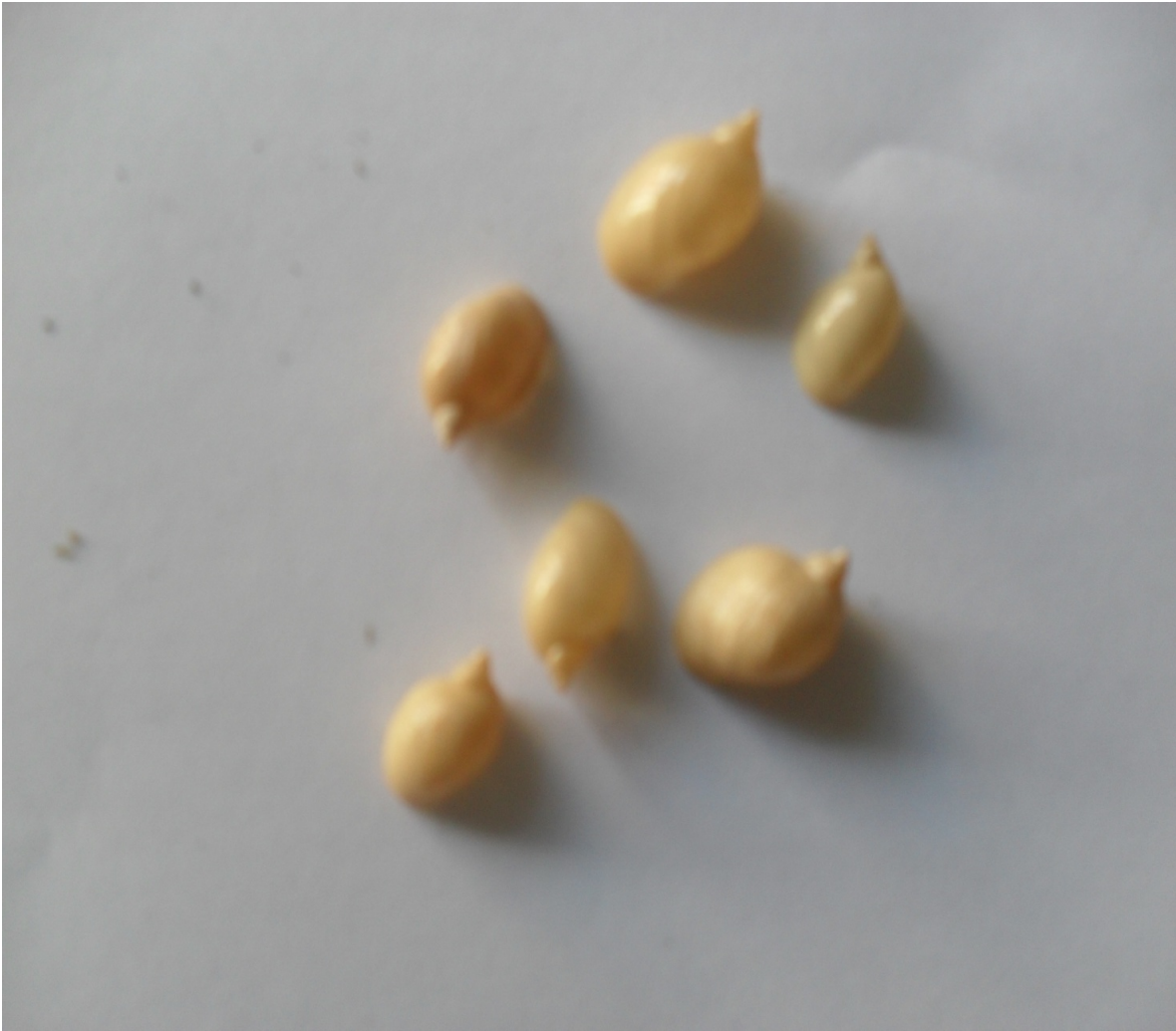
Figure 3. Shell of a host snail ( B. rohlfsi ) ©