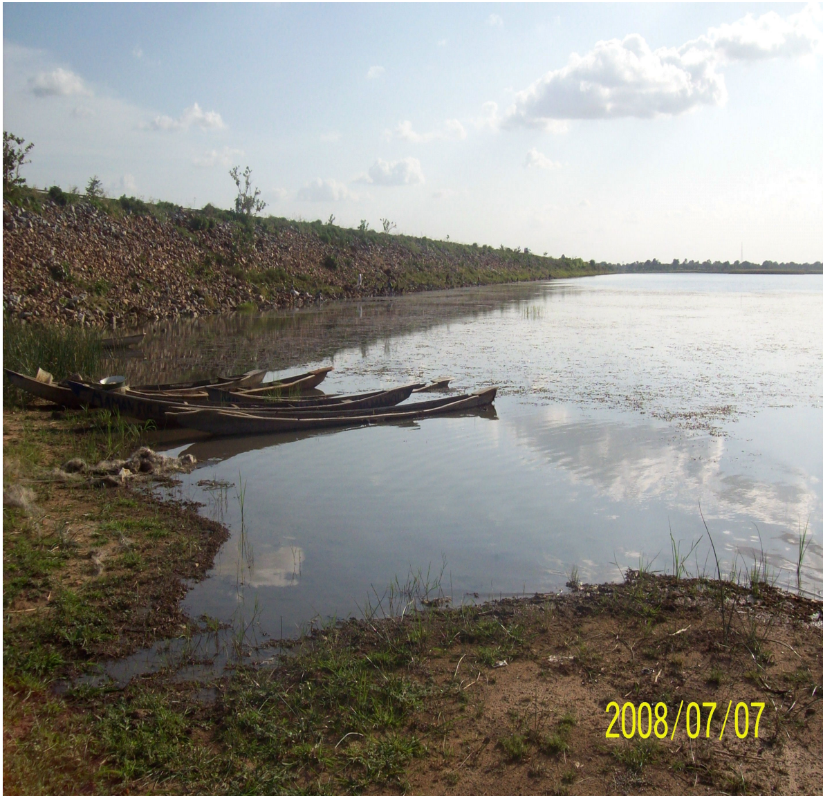
Figure 4. Rimin Gado dam, Rimin Gado area, Kano, Kano state, Nigeria.

is very prominent. Species of B. globosus and B. rohlfsi were collected there and water samples were taken.