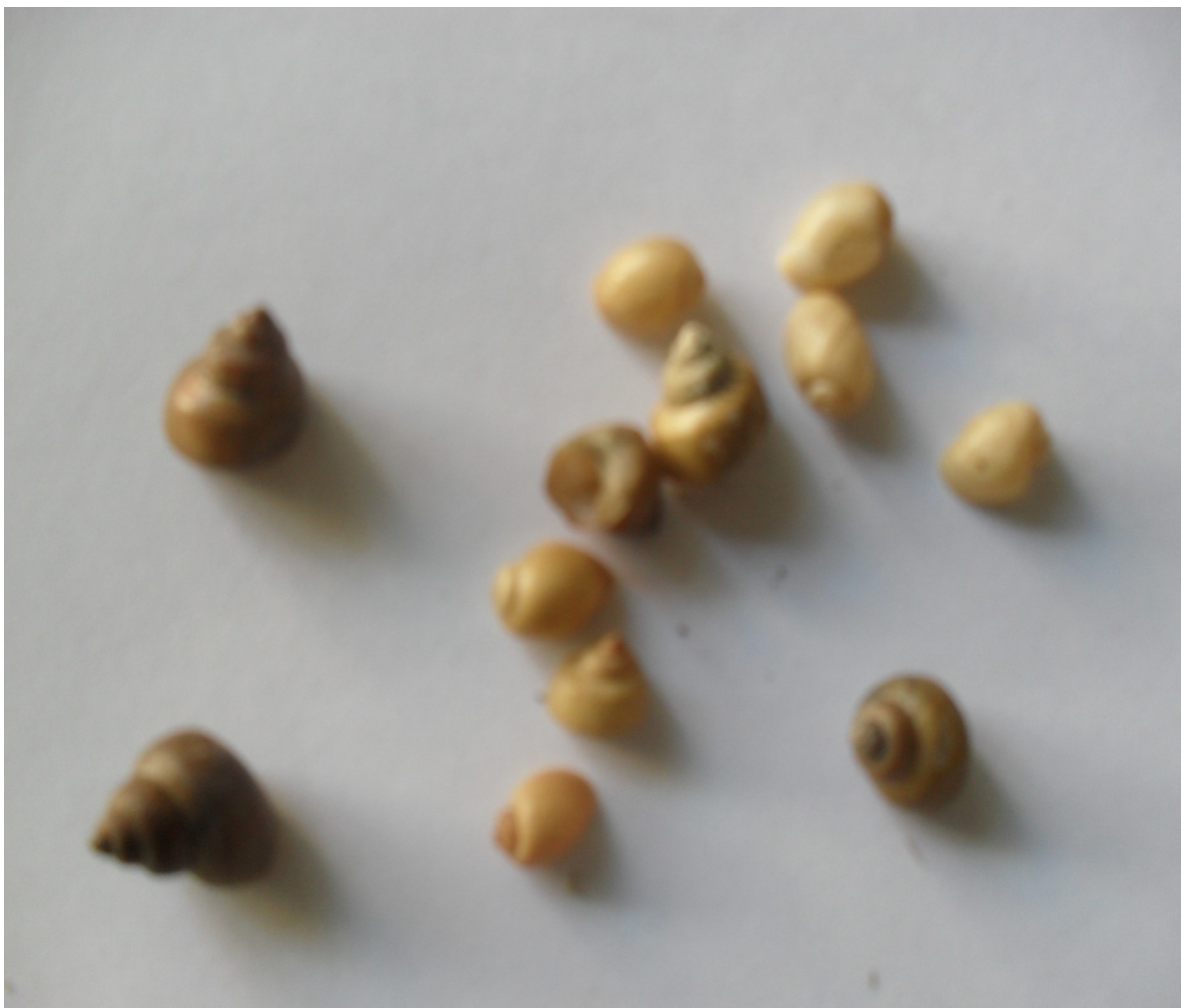
Figure 2. Shell of a host snail ( B.globosus ) ©

Reservoirs and Lakes: These are major habitats ranging in surfaces from 10 ha – 17000 ha. They undergo marked seasonal and long-term changes in water level. The aquatic vegetation is poor, the main colonizing plant being Typha