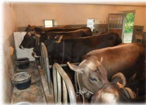
Figure 5. The cattleshed.

Milking is performed at 6.00 am and 6.00 pm by a cart machine; it starts with tail binding and then pre-dipping follows, i.e. a neutral liquid detergent (foam on) characterized by a sanitizing and softening action is applied. Such a procedure makes it easier to milk cows. To finish, post-dipping is carried out using a highly viscose solution of benzyl alcohol to pro-