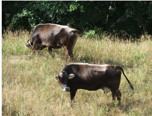
Figure 3. Pasturing Cabannina cows in Scabbiamara area.

compared against race specifications, height at withers, set from 1.18 to 1.20 m for females, and from 1.25 to 1.30 m for males, appears to be about 10 cm higher, as well as other parameters related to both sexes. Circumference of front shank, as well as head and rump bis-articular width remained unchanged.