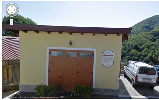
Figure 7. Petramartina dairy.

Since when named among Slow Food Presidia, Petramartina farm has been able to produce many different dairy products from just one ingredient, milk, which meets with the recent consumers' demand for products with a characteristic taste on which they can indulge. Physiologically, Cabannina breed cannot compete with milk production from Frisian. Being its quantity of milk per lactation equal to 26-30 kg, Cabannina raw milk sale would not be economically relevant. Nonetheless, the percentages of fat (about 3.7%), proteins (about 3.3%) and lactose (5.3%) make it particularly suitable for producing very good cheese, as recently confirmed by a recent study [11]. Briefly, Cabannina breeding is now possible thanks to its highly differentiated and tasty dairy products.