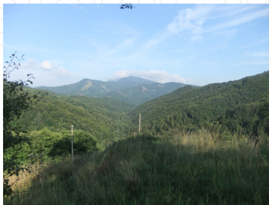
Figure 1. Aveto valley panorama, from Scabbiamara area.

Aveto Valley represents the natural settlement area of Cabannina cows. When a war correspondent, Ernest Hemingway wrote in his diary in 1945: “I have just passed across the most beautiful valley in the world”. In fact, it is one among the narrowest valleys of the northern side of the eastern Ligurian Apennine, where both the climate and the lands have unique characteristics thanks to the favorable altitude, which ranges from about 350 to 1800 meters, and the proximity to the sea. Rain is much more abundant than in the rest of the region, with about 2500 mm per year as peak value, especially in autumn and spring. In winter, snowfalls are stable, usually abundant, and temperatures can drop below 10 °C. In summer, the valley climate is humid and can become cooler at high altitude.