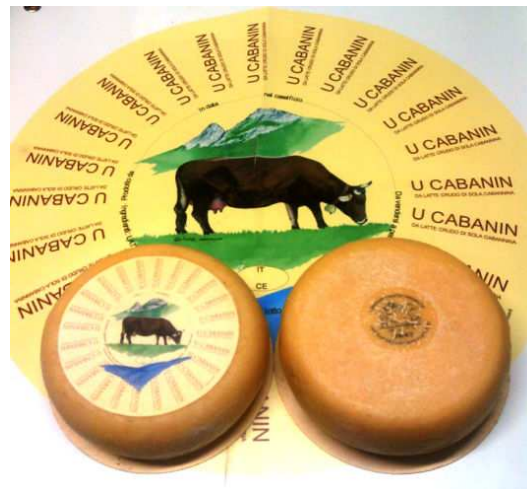
Figure 2. U'Cabanin trademark of Cabannina raw milk production.

Despite various interventions Cabannina heads have steadily declined. From a survey conducted in 2010 by the Provincial Association of Breeders, only 254 heads are left on the Ligurian territory, mostly concentrated in Aveto valley. In the same year Cabannina breed has got one of the 193 Slow Food Presidia on the Italian territory. The network of Slow Food Presidia was established in 1998; it protects and preserves traditional products made according to old techniques, often present in remote areas of our country, and makes them distinguishable by a logo.