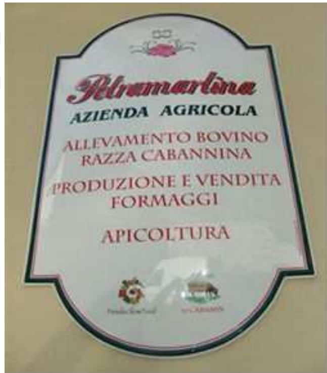
Figure 4. Petramartina Farm Logo.

can use is just close to the stable. In spring, the animals can graze freely. They are usually let loose day and night and lead to the cattleshed only for milking. During the night cows in lactation are kept in the pastures closer to the shed, whereas animals in dry and heifers can graze in the fields farther away.