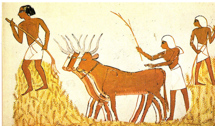
Figure 1. Painted grain and livestock growing together in ancient Egypt.

Since the ancient times, food production was exercised in farms where animals and plants were grown together (Figure 1). However, as a part of Green Revolution, the use of synthetic fertilizers turned out to be an integrated part of industrial agriculture which has progressively encouraged disintegration between cropping and animal husbandry. As a result, the consumptions of fertilizers have remarkably increased since half a century ago [1]. Indeed, disruptions in the cycles of nutrients have brought about environmental challenge that caused irreversible damages to natural ecosystems while reasonably justified by the real needs for food security for growing human population. As one of the main challenges in the world of agriculture, provision of phosphorus (P) for plant nutrition requires a closer look from several points of views.