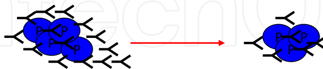
Figure 1. Immune Modulation of ABO or Crossmatch Incompatible Recipients

Immunoabsorption is a procedure in which plasma of the patient, after separation from blood, passes through a column containing an active component that binds or removes immunoglobulins specifically [5]. A newer column for immunoabsorption was created by Glycores Transplantation AB (Lund, Sweden). This Glycosorb® ABO column has a matrix of sepharose beads coated with blood group A or B carbohydrate antigens that removes isohemagglutinins against the corresponding blood group. The Glycosorb® columns effectively remove anti-A or anti-B antibodies with approximately a 30% reduction in A/B