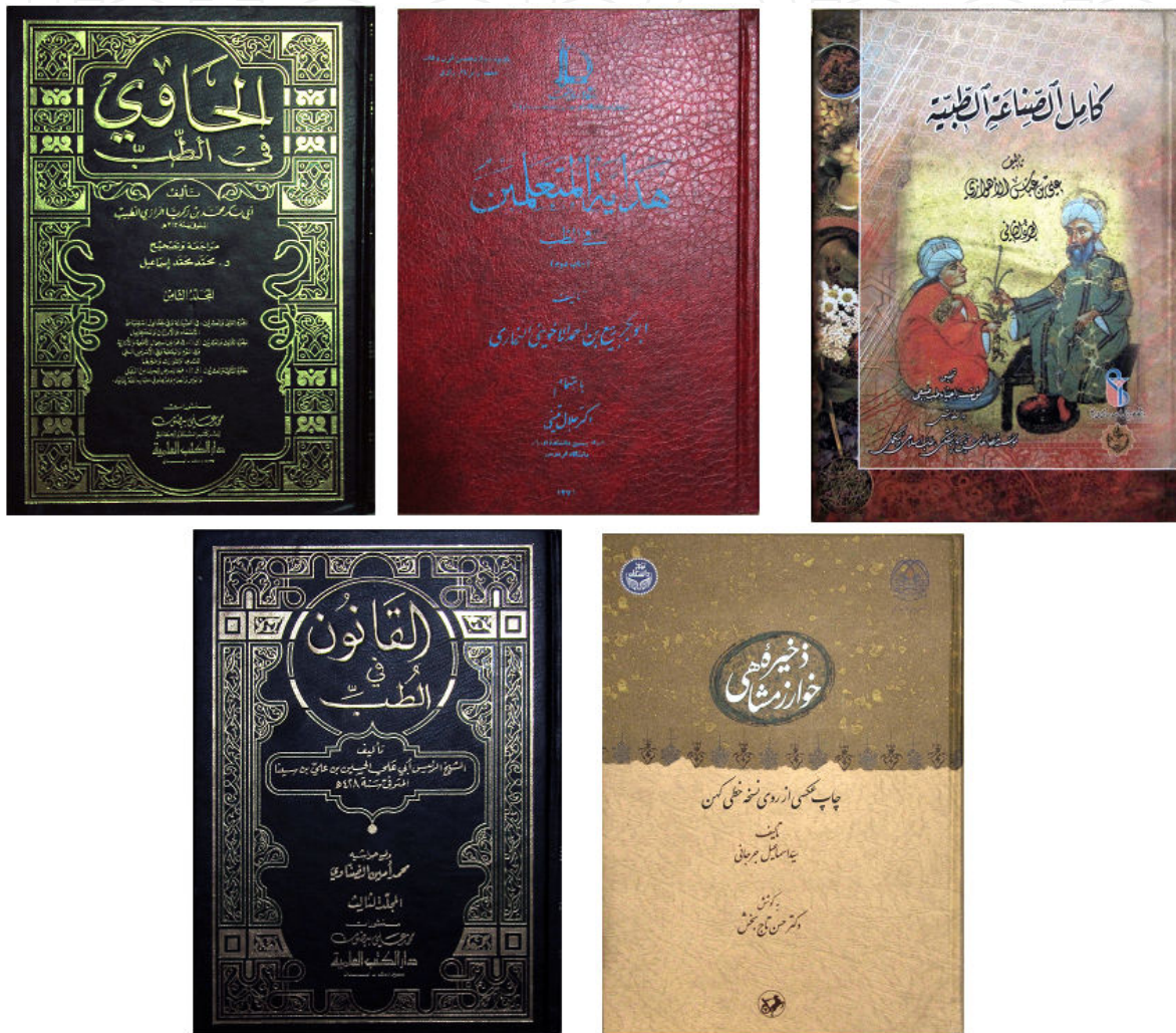
Figure 1. Cover image of main ancient Islamic Iranian traditional medicine books discussed in the present article. From left to right: al-Hawi fi al-Tibb, Hidayat-al-Muta'allimin fi al-Tibbe, Kamel al-Sina'ah al-Tibbiyah (upper row), and al-Qanun fi al-Tibb and Zakhireh Khaarazmshahi (lower row).

Avicenna has assigned a chapter of Canon to cancer [11]. From his point of view, cancer is a kind of black bile swelling, which is caused by the black bile resulting from burning of the yellow bile. After mentioning differential characteristics of cancer and scirrhous, he adds that cancer frequently affects hollow organs and for this reason, its prevalence is higher among