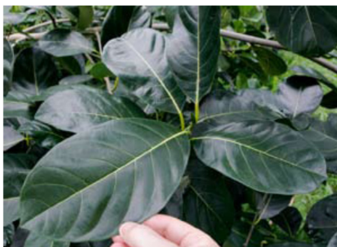
Figure 1. Mature leaves of A. heterophyllus

The root is a remedy for skin diseases and asthma and the extract is taken in cases of fever and diarrhea. The ashes of the leaves, burned together with corn and coconut shells are used alone or mixed with coconut oil to heal ulcers. Mixed with vinegar, the latex promotes healing of abscesses, snakebite and glandular swellings. Heated leaves alone are placed on wounds and the bark is made into poultices. The seed starch is given to relieve biliousness and the roasted seeds are regarded as aphrodisiac. In Chinese medicine the pulp and seeds are considered tonic and nutritious [12].