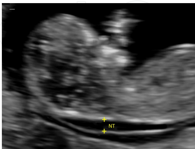
Figure 2. Increased nuchal translucency thickness (NT)

The association between the increased NT and the chromosomal abnormalities has been well documented (Figure 2). It helps us identify the high-risk fetuses for trisomy 21 and other chromosomal abnormalities [2,3].