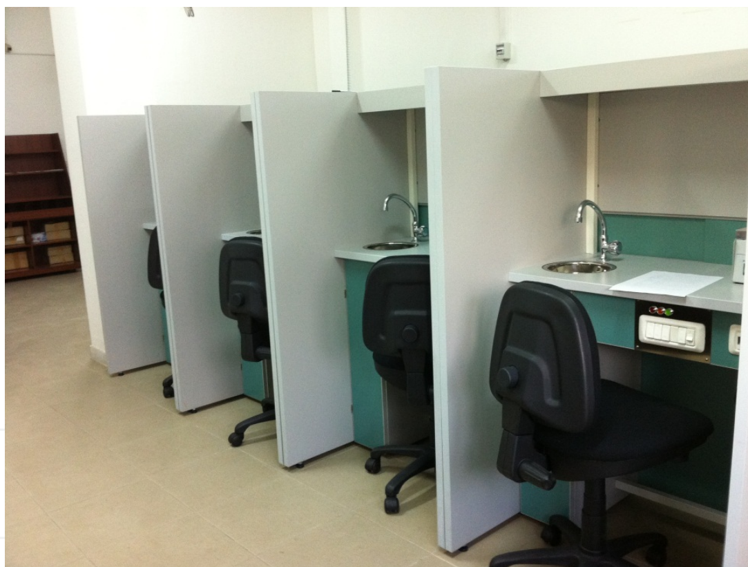
Figure 4. Cabins of the test room

The morning is the best time for tasting oils. It has been proved that there are optimum perception periods with regards to taste and smell during the day. Meals are preceded by a period in which olfactory-gustatory sensitivity increases, whereas afterwards this perception decreases. However, this criterion should not be taken to the extreme where hunger may distract the tasters, thus decreasing their discriminatory capacity; therefore, it is recommended to hold the tasting session between 10:00 in the morning and 12:00 noon (Fig. 4).