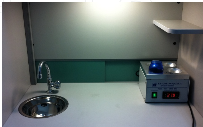
Figure 3. Heating the samples when in the glass

The glass shall contain 14-16 ml of oil, or between 12.8 and 14.6 g if the samples are to be weighed, and shall be covered with a watch-glass. Each glass shall be marked with a code made up of digits or a combination of letters and digits chosen at random.