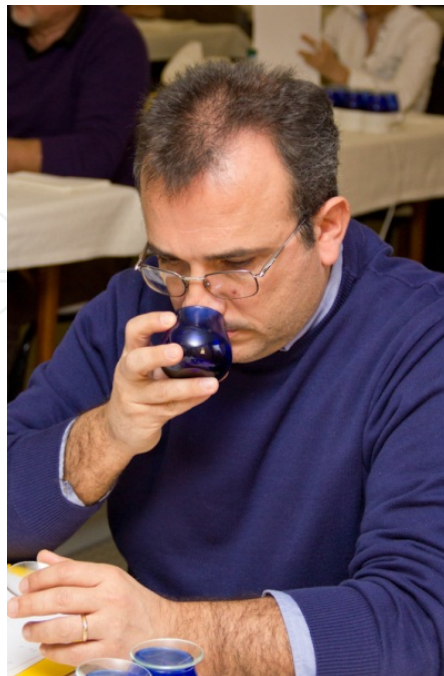
Figure 5. The olfactory test during

Once this stage is completed, he shall remove the watch-glass and smell the sample taking even, slow deep breaths until he has formed a criterion on the oil under assessment. Smelling shall not exceed 30 seconds. If no conclusion has been reached during this time, he shall take a short rest before trying again (Fig. 5).