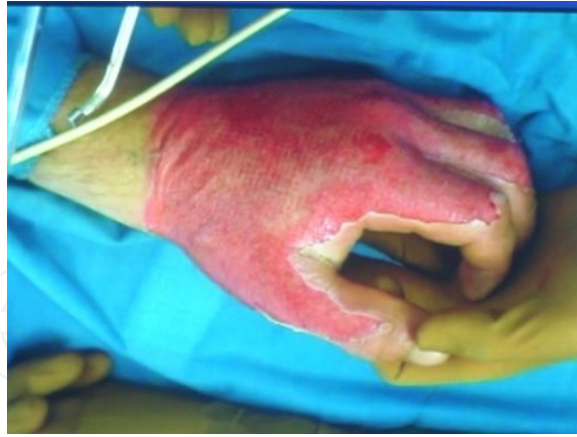
Figure 6. 45-year-old man, grade partial thickness burns on both hands