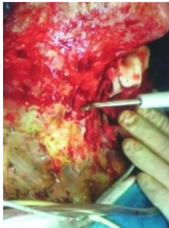
Figure 2. Necrosectomy with Versajet®.