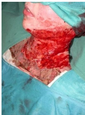
Figure 3. After necrosectomy.