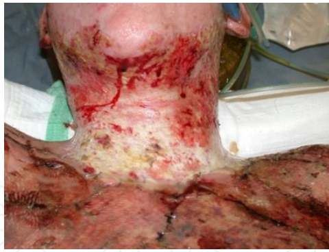
Figure 1. 6-year-old boy, grade partial to full thickness scalds in the chest and neck, 11% of body surface.