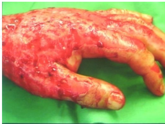
Figure 8. Post debridement