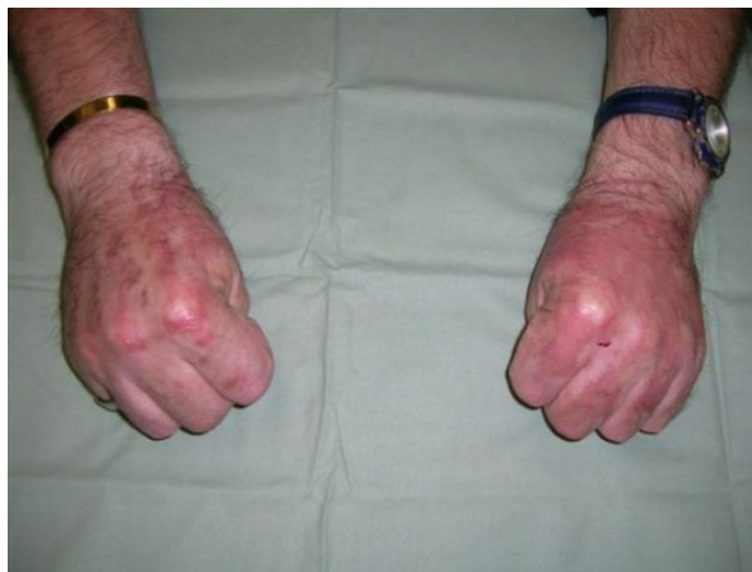
Figure 10. 6 months postoperatively, the left hand is covered with a split-skin graft while the right hand was treated by conservative means