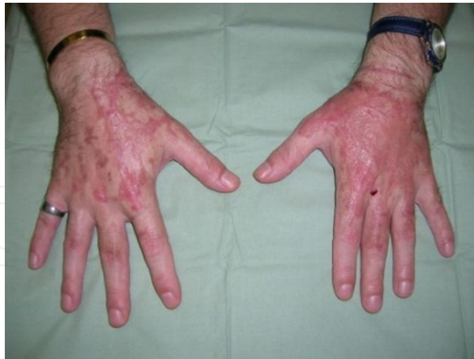
Figure 9. 6 months postoperatively, the left hand is covered with a split-skin graft while the right hand was treated by conservative means