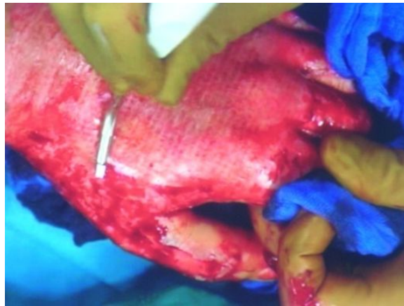
Figure 7. 45-year-old man, grade partial thickness burns on both hands