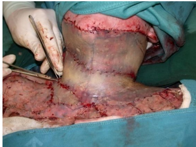
Figure 4. Split-thickness skin graft, unmeshed