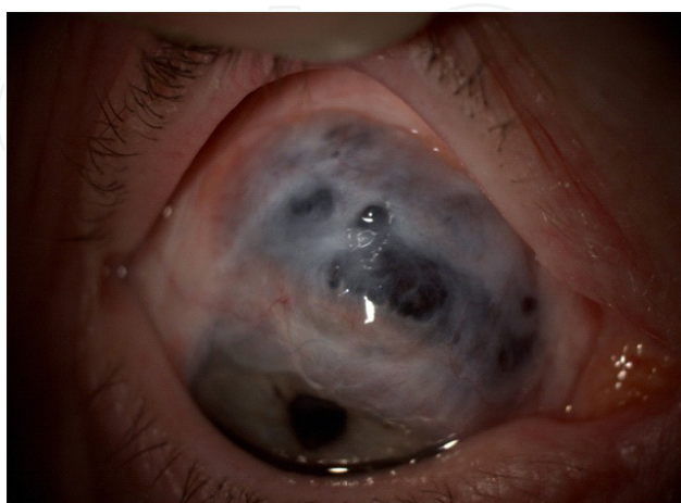
Figure 1. Scleromalacia perforans in patient with long-term RA.

In echocardiography pericardial effusion is revealed in 31% of patients [11]. 1 - 5% of patients with RA are diagnosed with vasculitis, while autopsy studies detect these changes in 15-31% of patients [12,13]. Changes in the eyes in the course of RA are observed in approximately 25% of patients [14, 15]. The treatment of RA is based on disease-modifying drugs (DMARDs) such as methotrexate, sulfasalazine, leflunomide, cyclosporine, cyclophosphamide, hydroxychloroquine or chloroquine and gold salts. Furthermore, patients often have glucocorticoids and non-steroidal anti-inflammatory drugs (NSAIDs) administered orally or locally (intra-articularly). In the contemporary rheumatology in case of ineffectiveness of the traditional DMARDs therapy second line treatment is implemented - based on biological agents. These include TNF-alpha (tumor necrosis factor) inhibitors such as adalimumab, certolizumab pegol, etanercept, golimumab, infliximab as well as drugs with other mechanism of action such as abatacept (anti-CTL-4), rituximab (anti-CD 20) and tocilizumab (anti-IL-6) [16].